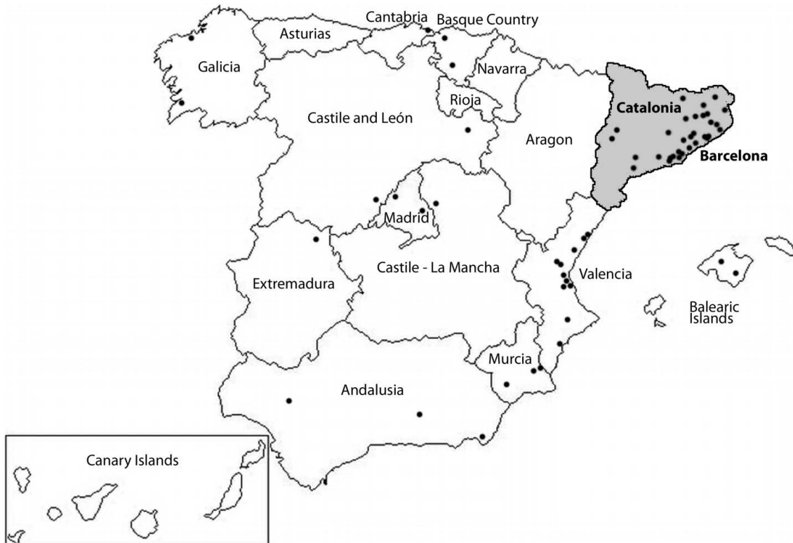
MAP 1. Sites of mosque opposition in Spain