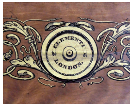
FIGURES 7 & 8. Keyboard and label.