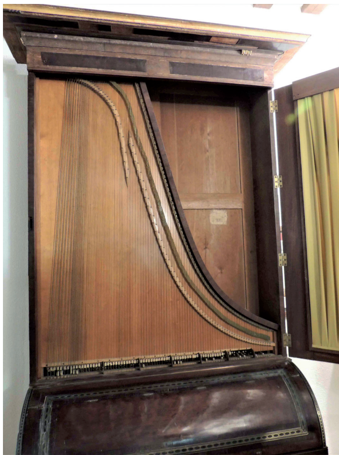
FIGURE 4. Soundboard, bridge and strings.

The cabinet is divided into two sections. The upper one is the piano, properly displayed, giraffe-like, like a vertically positioned grand piano. The soundboard extends for the entire length of the strings (Figure 4). The tuning pins are located just above the keyboard and the mechanism is placed behind the wrestplank. Hammers and dampers operate from behind. This structure is very similar to that of a grand piano. This whole part rests on the lower section, a platform with four legs on wheels, from which the lyre with three pedals also hangs.