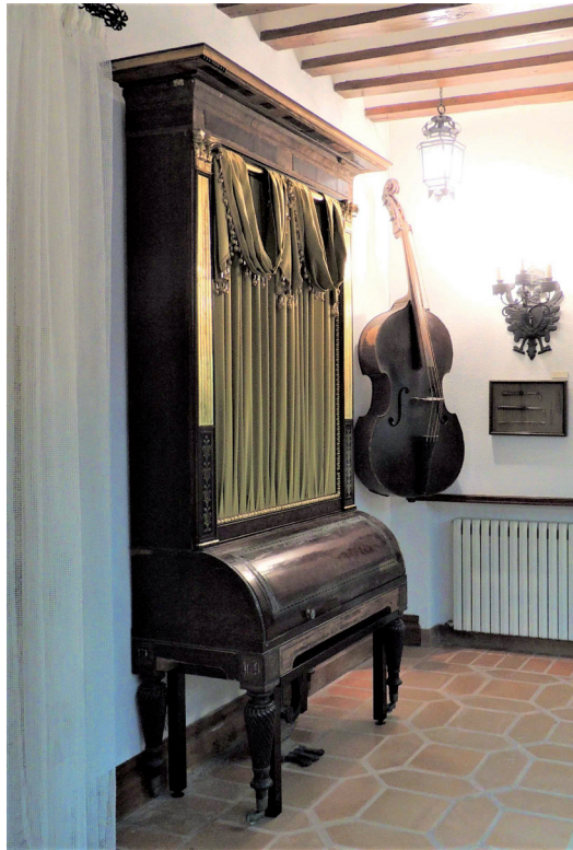
FIGURE 1. General view of the piano in its present state.