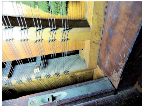
FIGURES 2 & 3. Engraved number 368 and ink number 10569.