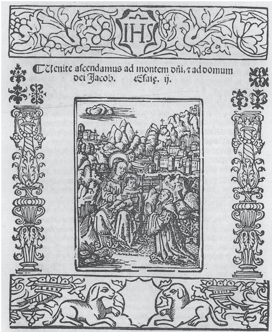
Pere de Burgos, Libro d'los Milagros hechos a invocación de nra señora de Montserrat: y dela Fundacion Hospitalidad y Orde de su sctā casa; y del Sitio della y d'sus hermitas (Barcelona: Pere de Montpezat, 1550), opening illustration (Courtesy of the Monastery of Our Lady of Montserrat Library).