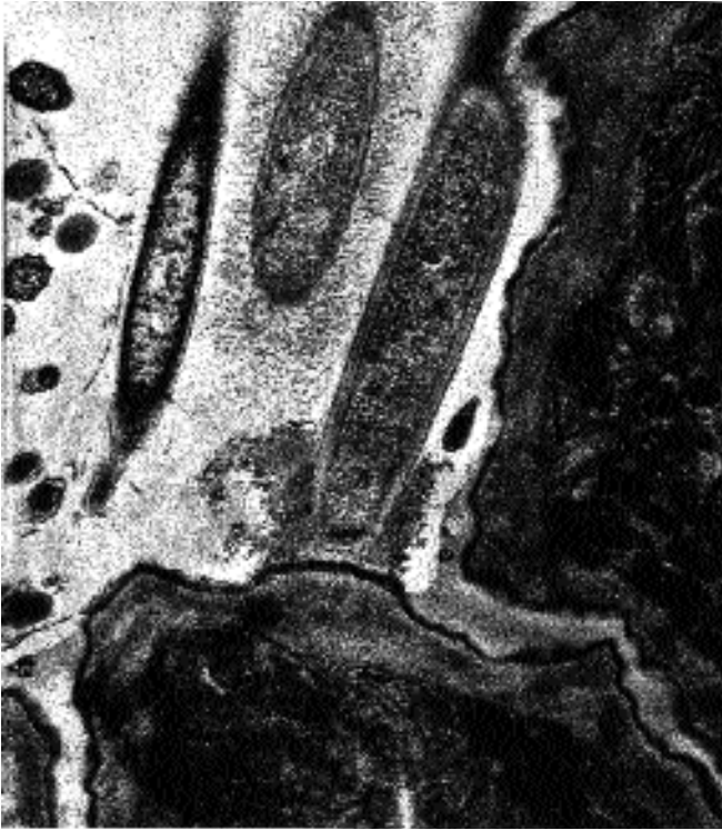
Fig. 2 “ Arthromitus ” attached to the chitinous gut wall of the California termite, Reticulitermes tibialis . Portions of the termite epithelial cells are seen at the bottom and right side of the transmission electron micrograph. The attachment structure seems to be composed of exudate from the bacterium and local thickening of the insect chitin at the region of attachment. The dark bodies just inside the chitinous layer are termite mitochondria. This protograph, taken by David G. Chase in about 1984, reveals in detail the “ Arthromitus ” intestinal attachment first described by Joseph Leidy. (Magnification, ca. 50,000 \times )

of moisture and food. The short flagellated filaments course through the intestines looking for “docking sites”. They find them, usually at the surface of the chitinous epithelium, as documented by electron microscopy (Fig. 2). They attach,