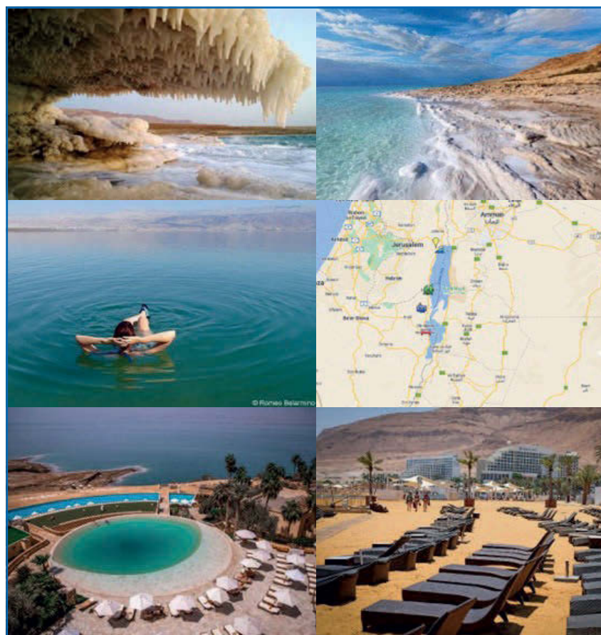
Figure 2: Dead Sea – a wonder in the world.

As figure 1 demonstrates: the use of a relevant context-based situation is important, as relevance is a very useful precursor for developing students' personal interest and a powerful stimulus for science learning (Gilbert, 2006; Pilot and Bulte, 2006). The theoretical construct is that relevance drives students' motivation to learning and once relevance is established, the motivation for involvement can go beyond the context-based scenario and lead into scenario-related conceptual science learning. Unfortunately, standard approaches, which assume science is inherently interesting for students, if taught well, have been shown to have