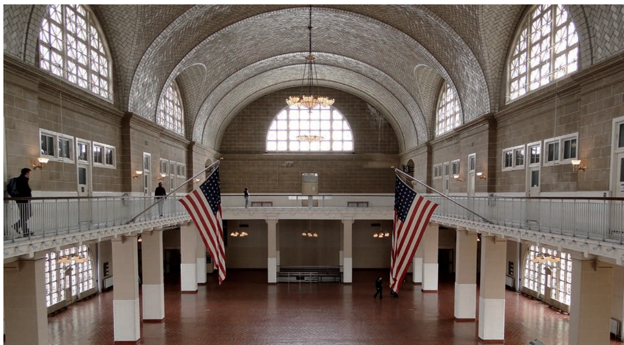
Fig. 1. Current view of Ellis Island Registry Room, where immigrants went through medical and legal inspections. It was restored to host the Ellis Island Immigration Museum.

Rafael Guastavino was born in Valencia, Spain on March 1, 1842, the fourth of fourteen children of Pascuala Moreno and Rafael Guastavino, the son of an Italian immigrant that