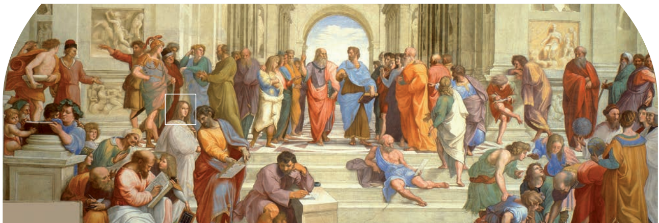
Fig. 1. Fragment of The School of Athens , one of the most famous frescoes by Raphael, painted for the Apostolic Palace in the Vatican between 1509 and 1510. The interpretation of this figure as Hypatia (square) seems to have originated from the Internet. With some exceptions, serious sources do not accept it.

1909 The first National Woman's Day was observed in the United States on 28 February. The Socialist Party of America designated this day in honor of the 1908 garment workers' strike in New York, where women protested against working conditions.