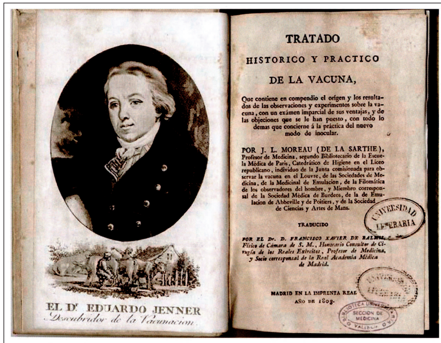
Fig. 4. Balmis' Spanish translation of Traité historique et pratique de la vaccine by J.L. Moreau.

highly disciplined, had received solid professional training, and was a good leader. He was familiar with the colonies in America, particularly Mexico, where he had already carried out variolization. Enthusiastic about the vaccine, he had translated the French book by J.L. Moreau de la Sarthe, the highest authority on the subject (Fig. 4). From the beginning, he completely identified with the expedition's objectives. Just after his appointment, in June 1803, he began to meticulously undertake the necessary preparations.