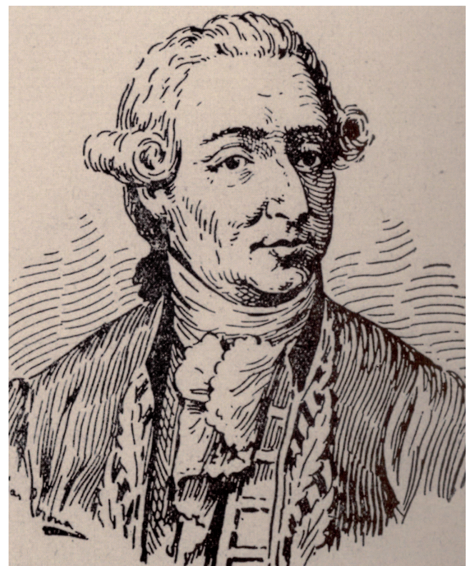
Fig. 3. Portrait of Xavier de Balmis (1753–1819).