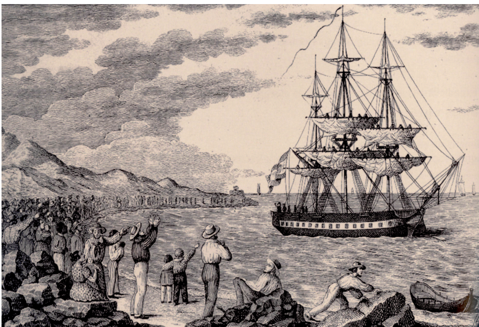
Fig. 6. Engraving of the departure of Royal Philanthropic Expedition of the Vaccines.

The Pacific journey was much more difficult than the Atlantic one because it was made on a mail ship that lacked the comforts of the Maria Pita . The children slept on the floor, where rats abounded, and the ship's movements caused some chil-