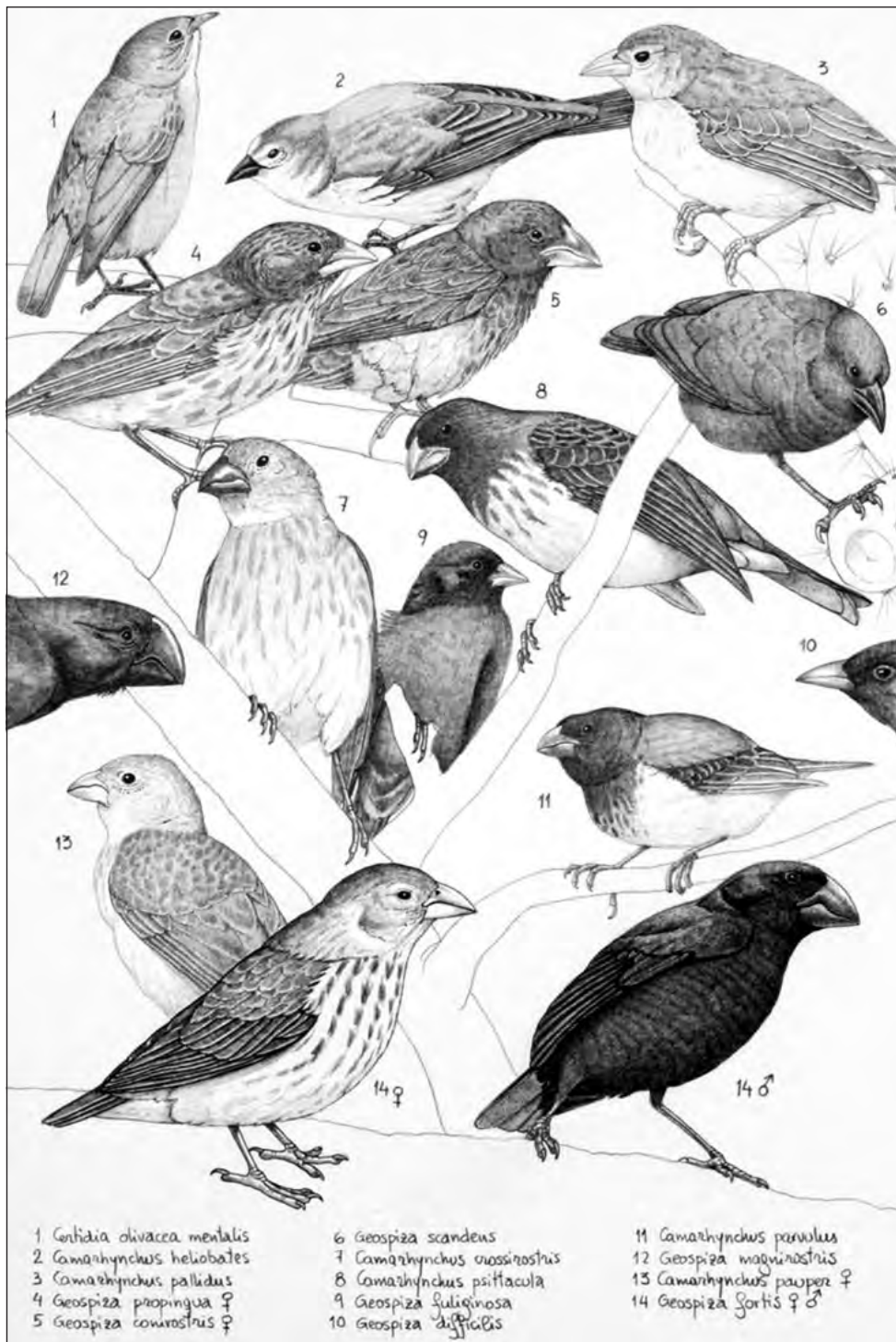
Fig. 3. Darwin's finches. Contribution of naturalist illustrator Carles Puche to the Darwin Year 2009.

ferentiation between the sexes; there was recognition of the co-evolution of species and what Darwin called "the economy of nature," or the biological processes we now describe as ecology; and there was the gradual evolution of living organisms similar to the gradual character of geological change over time. In this scenario, the role of an interventionist and capricious God in creating species from time to time, and of course maintaining them, was unnecessary. When early geologists found marine reptile fossils, the conventional wisdom then was that if only they looked hard enough they would find these same species alive somewhere else on Earth.