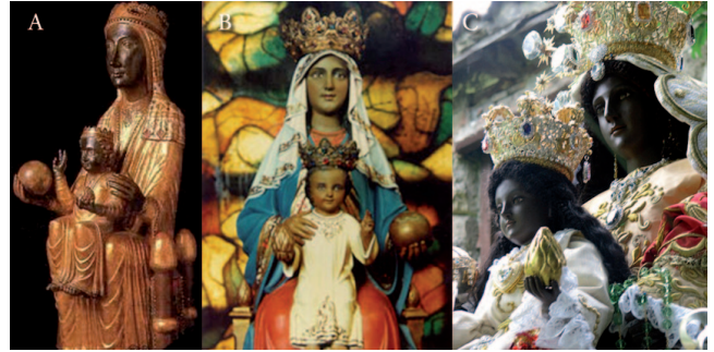
Fig. 4. Images of Our Lady of Montserrat. (A) Twelfth-century sculpture. Abbey of Montserrat, Catalonia. (B) Abbey of Our Lady of Montserrat, Manila. (C) "La Morenita," from the Ancheta family. Grand Marian Procession, Intramuros, Manila (2007).

I later found out that, even though Cataluña and España streets used the Spanish spelling with the ñ ( enye in Filipino), the name of these countries is written with ny in modern Filipino. This unique point unites Filipino and Catalan orthographically, since Spain and Catalonia are written the same way in both Catalan and Filipino ( Espanya/Catalunya ). This should also be the case for Peñafort/Penyafort .