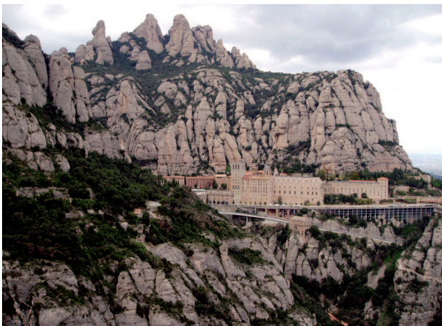
Fig. 3. Abbey of Montserrat, Catalonia.

Cataluña Street. The Sampaloc district and its urban planning, where the UST campus lies, captivated me instantly, despite the constant traffic on España Street. The Tagalog word sampaloc (tamarind fruit) also stuck with me. The urban layout of this district reminded me of an area of Barcelona dating from the early 20th century, known as the Eixample . Not far from the UST campus, just a few streets away, I discovered the Cataluña Bakery and Store, at Cataluña Street (now GM Tolentino Street). I discovered that pan desal , despite the name, is sweet not salty. I also tasted ensaymada . I was proud that the Tagalog language had a word of Catalan origin that had come to it through Spanish. Ensaymada comes from the word saim , which is what the people from the Balearic Islands call lard.