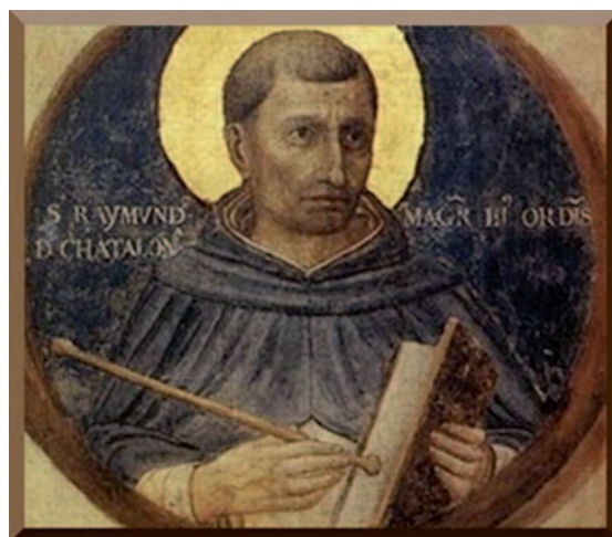
Fig. 1. Saint Raymond of Penyafort, O.P. patron saint of lawyers. His feast day is on 7 January.