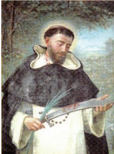
Fig. 2. Saint Pere Almató, O.P., born in Sant Feliu Sasserra (Catalonia). Missionary in the Philippines and Vietnam, where he was martyred after being beheaded; this is why he is depicted with the palm of martyrdom and a scimitar. His feast day is on November 3.

currently a great devotion to him. He was canonized in 1988. He is depicted with the palm of martyrdom and a scimitar, since he was killed by beheading (Fig. 2). Every 3 November, a large feast is held in his honor at the place where he was born. I can recommend it.