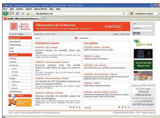
Fig. 1. MERIDIÀ web portal