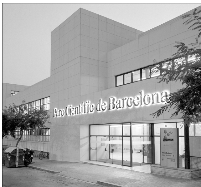
Figure 1. PCB modular building.