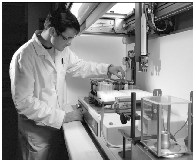
Figure 2. Combinatorial Chemistry Platform.