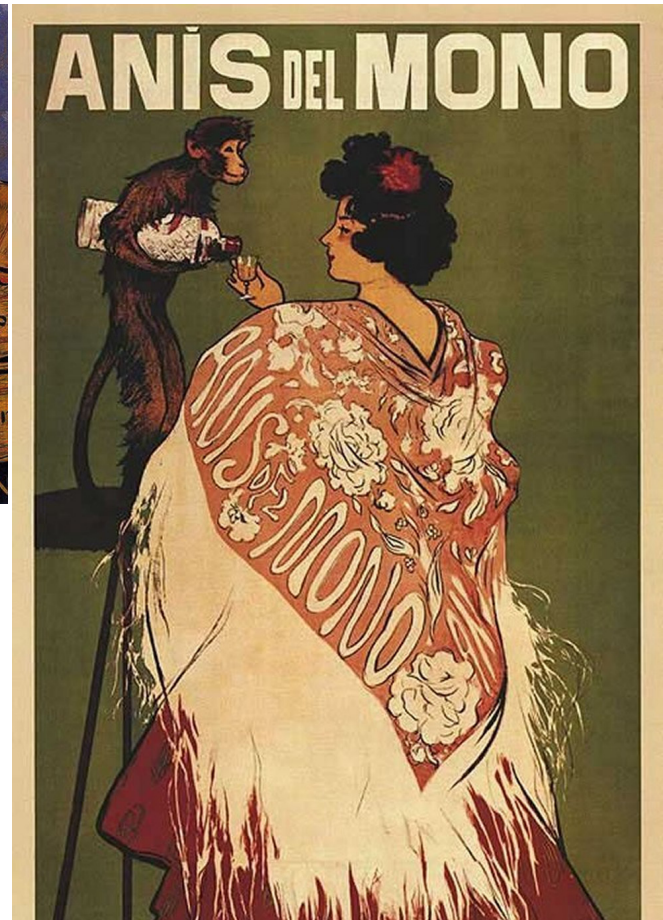
Anís del mono printed poster (R. Casas, 1898) [5].

All over his artistic life he nurtured his ties to painter Santiago Rusiñol (with whom he had a mutual influence), and sculptor Enric Clarasó. Their joint exhibitions at Sala Parès, in Barcelona, were a regular occurrence for many years. Miquel Utrillo was another friend with relevant influence on Casas' life; among other aspects, as a promoter in many initiatives