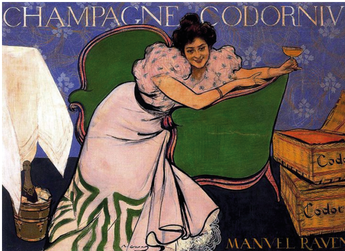
Champagne Codorniu printed poster (R. Casas, 1898) [5].