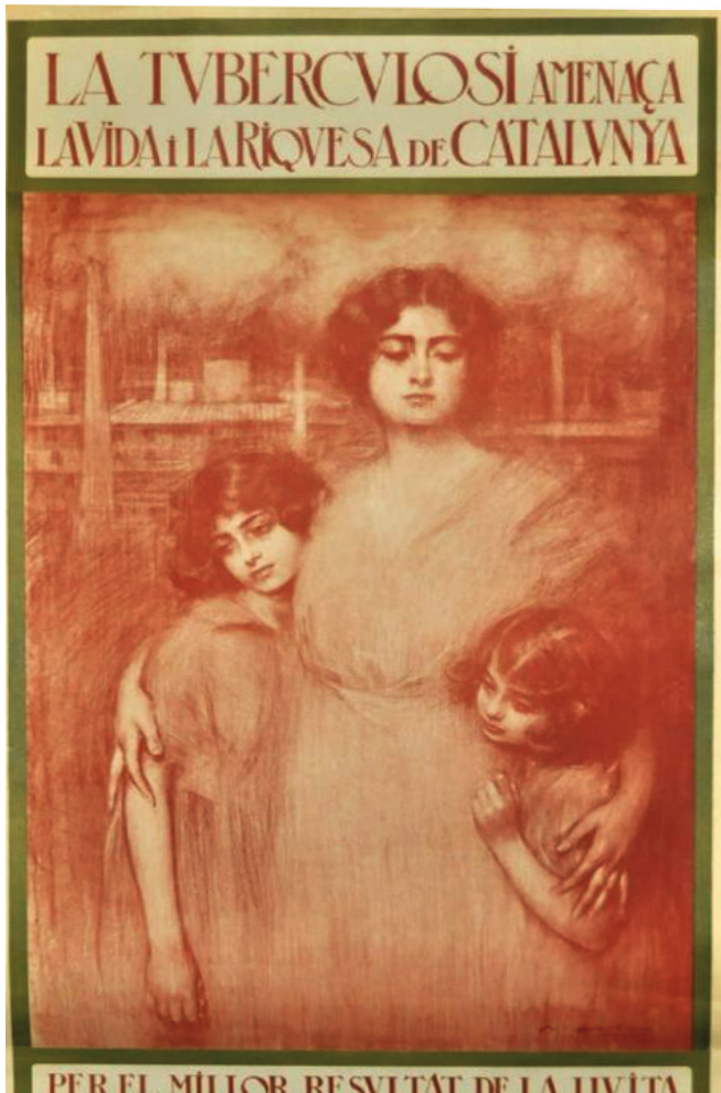
Tuberculosis poster (R. Casas, 1929). (Thomas printer, 155 x 106 cm.)