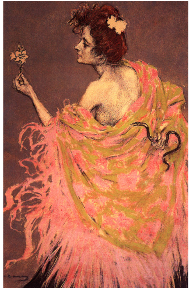
Syphilis poster (R. Casas, 1900) [5]. (Thomas printer, 46 x 28 cm.)

The label of the anisette crystal special bottle showed since several years ago the face of a monkey that clearly resembled Charles Darwin. We do not know if Casas had read On the Origin of Species (originally published in November 1859 and whose Spanish translation was published in 1877), or Darwin's book on the origin of man, The Descent of Man, and Selection in Relation to Sex (published in 1871 and translated into Spanish in 1880). Probably not, because he did not paid special attention to science. In any case, Darwinian theory had become popular among intellectuals, but it was misunderstood and many people thought that humans had evolved directly from monkeys. All this without going into any depth on a theory that changed not only the knowledge on the origin and evolution of life but also the concept of human nature itself.