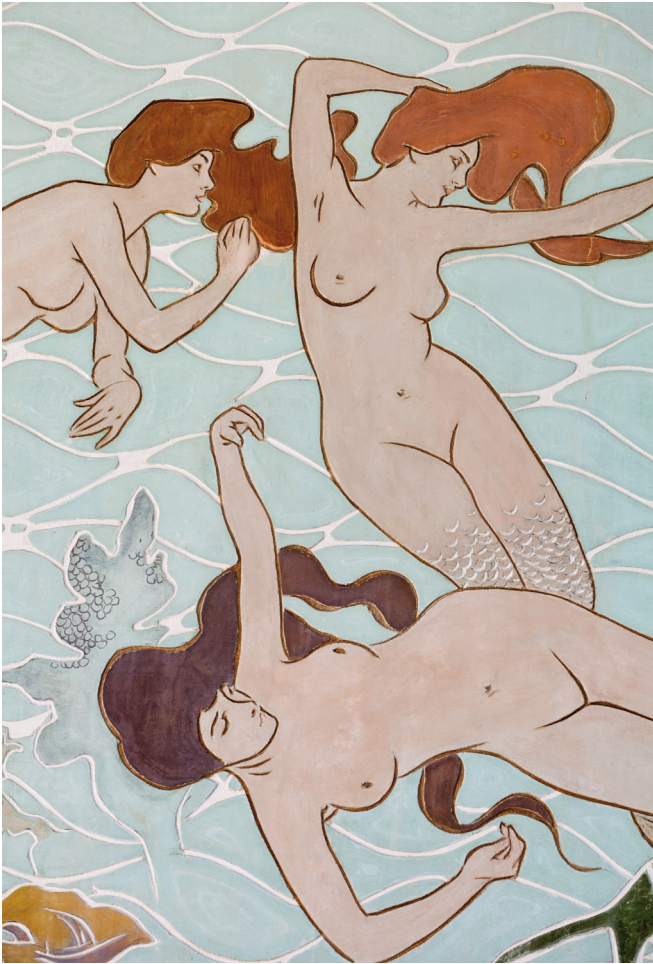
The Garden of the Mermaids (R. Casas, 1904). Walls of the dining room of the Fonda España.

painted about a dozen portraits in oil. He went to Miami and from there to Cuba. His intention was to visit friends and also go to Matanzas, the province where his father had lived for many years.