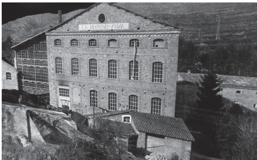
Fig. 1. Premises of La Hispano-Suiza in Ripoll (named Comforsa since 1987).