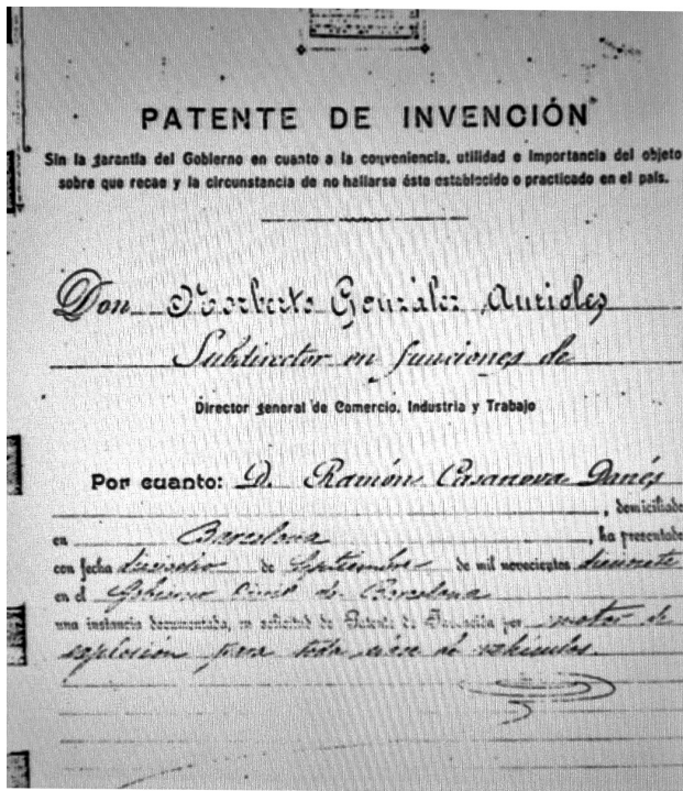
Fig. 3. Spanish patent (September 18, 1917) of the pulse jet engine invented by Ramon Casanova.