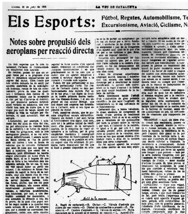
Fig. 4. Part of the page of La Veu de Catalunya (June 20, 1919), showing the engine draw. Note that the article was included in the sports section.

Catalan newspapers: La Veu de Catalunya (June 20, 1919) (Fig. 4), and La Publicitat (June 9, 1928).