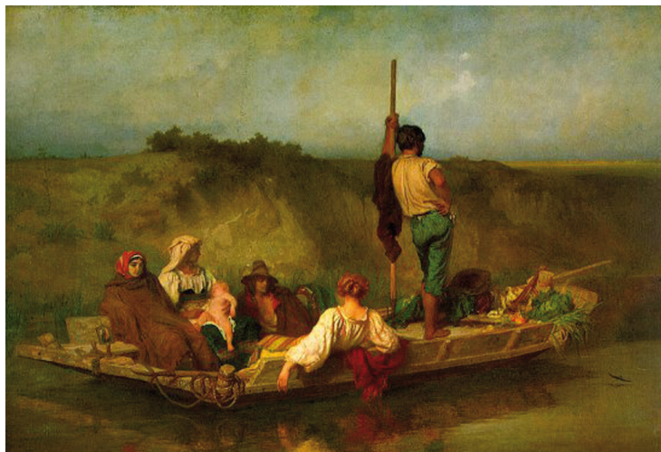
Fig. 4. Detail of La Malaria (1850-1851), oil on canvas by French artist Antoine Auguste Ernest Hébert (1817–1908). Hébert's painting conveyed admirably the melancholy of diseased country people and the blurring pestilential environment where they lived. The malaria (bad air) can be indeed perceived in the painting, one of the best-known works of the artist. This painting was on the cover of Int Microbiol 2006, issue 9(2).