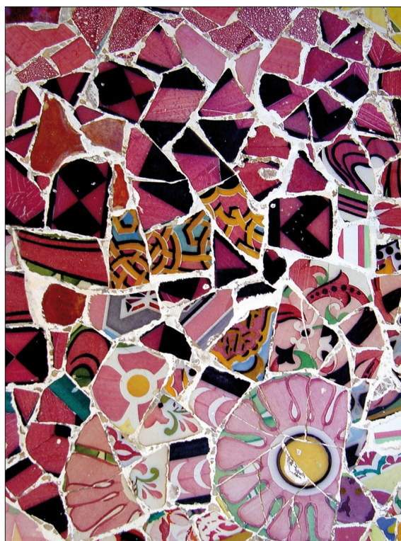
Trencadís ("broken tiles") by Antoni Gaudí

Academia Europaea-Barcelona Knowledge Hub