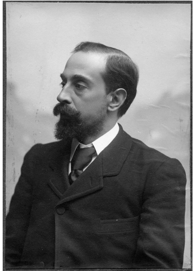
Figure 2. Portrait of Joan Maragall (Barcelona, 1860-1911). Catalan poet and writer, a crucial figure in modern poetry at the shift from the 19 th to 20 th centuries.