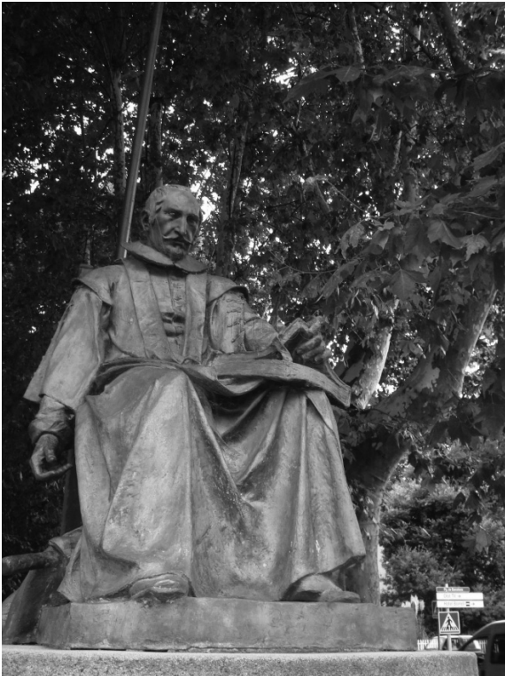
Figure 2. Monument to the jurist and politician Joan-Pere Fontanella (Olot, 1575 - Perpignan, 1649) in Olot, the city of his birth. It is the work of sculptor Miquel Blai.

absolutist and pro-uniformity tendencies were tamped down, since institutional diversity was interpreted as an obstacle to the strengthening of royal power.