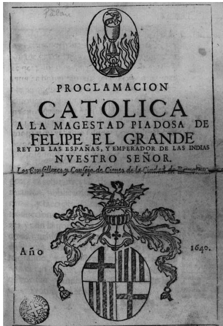
Figure 4. Cover of one of the propaganda books on the 1640 Catalan uprising written by Friar Gaspar Sala.

a Catalan militia; they implemented and collected new taxes; they coined money; and they turned themselves over to the sovereignty of Louis XIII of France after having broken the bonds of loyalty that bound them to Philip VI.