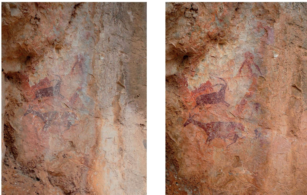
Figure 7. Painted panel in Cabra Feixet before and after the cleaning intervention.

the fingers can be clearly identified, as well as the entire string of the bow he is holding.