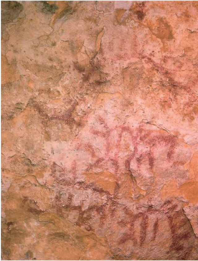
Figure 1. El Portell de les Lletres (Montblanc, Tarragona).

set of rock paintings currently known as El Portell de les Lletres (Montblanc, Tarragona).