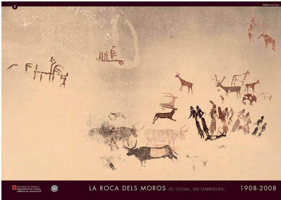
Figure 8. Poster of El Cogul published to celebrate the centennial of its discovery.

Perelló) as part of the Corpus of Rock Paintings of Catalonia project, the only one of its kind on the Iberian Peninsula, Catalonia embarked upon a pathway which all the other autonomous communities have followed, albeit to uneven success. 45