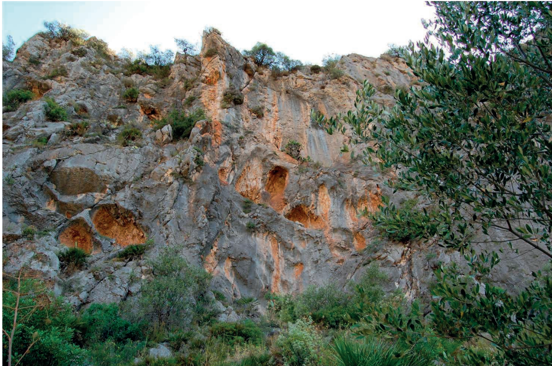
Figure 4. Shelters in Pla de Petracos (Castell de Castells, Alicante).

rations in Or, La Sarsa and La Falguera, where the X and double Y anthropomorphs are also associated with schematic art. 26