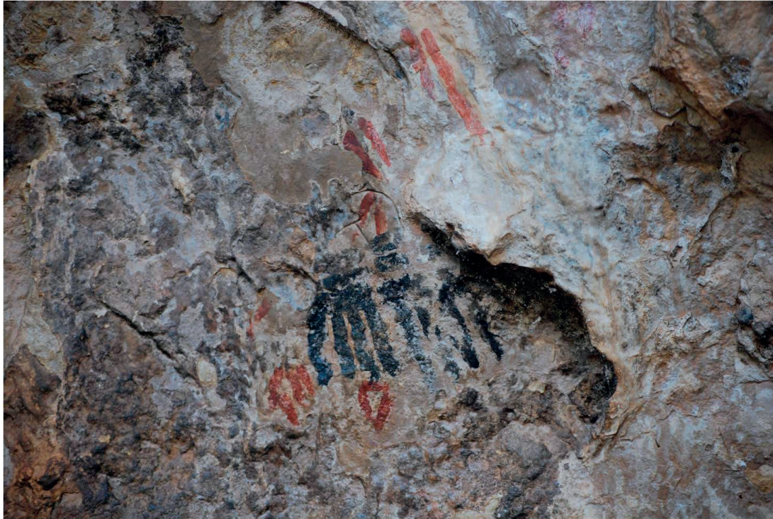
Figure 6. Schematic art. Barranc de Carbonera (Beniatjar, Valencia).

In fact, through their association with other motifs, some of these motifs date from later, which would also corroborate the portable record from the late Neolithic and Eneolithic.