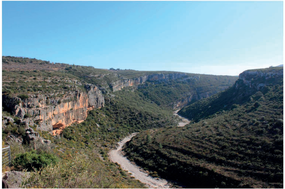
Figure 5. Barranc de la Valltorta. Visibility from Mas d'en Josep (Tírig); in the background, the La Saltadora shelters (Coves de Vinromà, Castellón de la Plana).

(Obón, Teruel) has also been identified in other shelters in Teruel, Alicante, Murcia and Albacete. With regard to other motifs, we could cite the scenes of clashing humans, male and female representations, a woman next to a man's corpse in Abric Centelles, the discovery of a new tree in La Sarga and the spatial distribution of certain animals, such as boars and bovids, which must be a continuation of other animal depictions. In a similar vein, restudying the human figure as I. Domingo Sanz did or some of the objects like arrowheads is also of vast interest. The most unique contributions are unquestionably related to the composition and internal structure of the scenes, and one example worth pursuing further is the studies performed in Cova dels Cavalls (Tírig, Castellón de la Plana), which stands out at the Valltorta site.