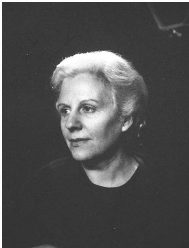
Figure 4. Mercè Rodoreda (1908-1983) in a studio photo taken in Geneva in the 1960s. She is considered the most influential contemporary Catalan writer.

first chapter to the “cry of hell which I must have held inside me for many years” released in the middle of the square. And then, from the distance of time, she merges external reality, internal reality and different ways of appropriating them, that is, all the elements that form part of experience, from the conscious to the subconscious.