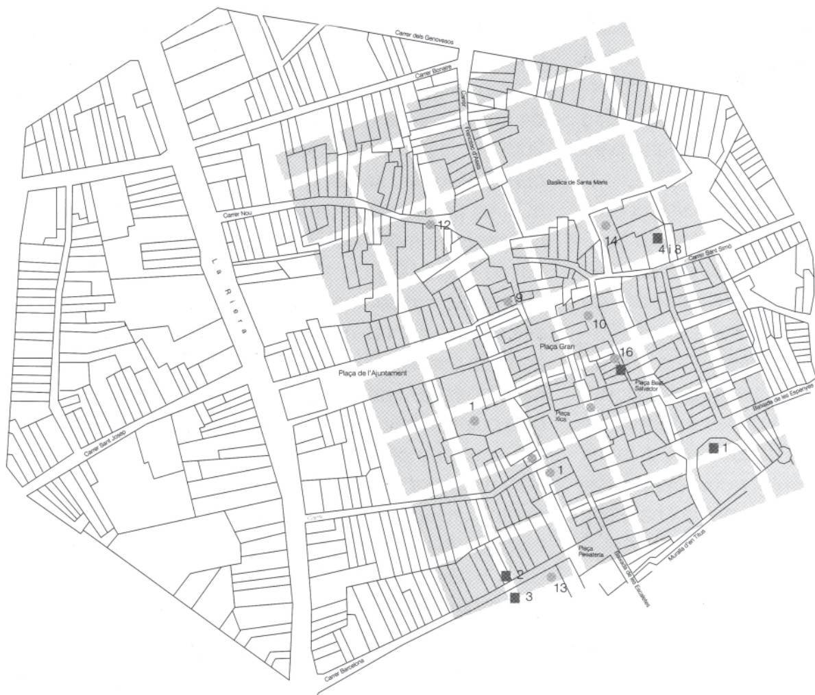
Figure 2. Urban planning layout of the Roman town of Iluro (Mataró). Inside the black box are the sites that we have been able to date from the early years of the 1st century BC (from Garcia et al. , op. cit., note 14, p. 42).

With regard to the layout of urban space, the environs of what is today the basilica of Santa Maria have been pinpointed as the possible site of the city forum, and on the southeast corner of this area remains of baths have been found dating from the imperial period, which were most likely built in the area set aside for this purpose back in the initial plans. 13