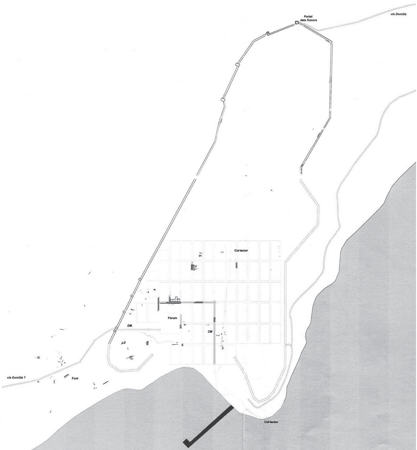
Figure 11. Tarraco (Tarragona): Layout with remains from the Late Republican period with an interpretation of the urban layout of the southern part of the walled premises (from Macias et al. , Planimetria... op. cit. p. 27).

this scheme was only conducted on the southern part of the walled premises, south of today's Rambla Nova, is quite provocative. In the area located between Rambla Nova and the upper part, a regular urban planning model would not have been applied until a later date, perhaps in the second half of the 1st century BC. However, this does not mean that before then it was a construction-free zone, as archaeology has documented Late Republican structures that seem to predate the urban remodelling of this