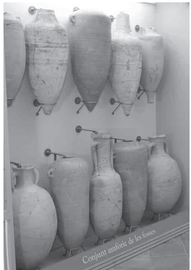
Figure 8. Sample of amphorae found inside the graves that can be dated from the start of the city of Iesso (Guissona).

With regard to the proto-historic settlement in Guissona, archaeology has documented it only partly, but enough to state that it developed over several centuries yet was abandoned at the height of the Iberian period in around the 4th and 3rd centuries BC. There must have been a population contraction in the early 4th century BC, just like in other points around the country, when people tended to enclose themselves on high ground, which was easier to defend. The Puig Castellar Iberian settlement in Talteüll, located six kilometres northeast of Guissona on a hill next to the Llobregós River within the township of Biosca, was quite probably the point where the inhabitants of this zone concentrated at the peak of the Iberian period. On the land of what is today Guissona, the fountain might still have been frequented between the 4th and 2nd centuries BC, and there might have been some shack or small, modest home, but not an Iberian settlement per se. The city of Iesso was founded in the