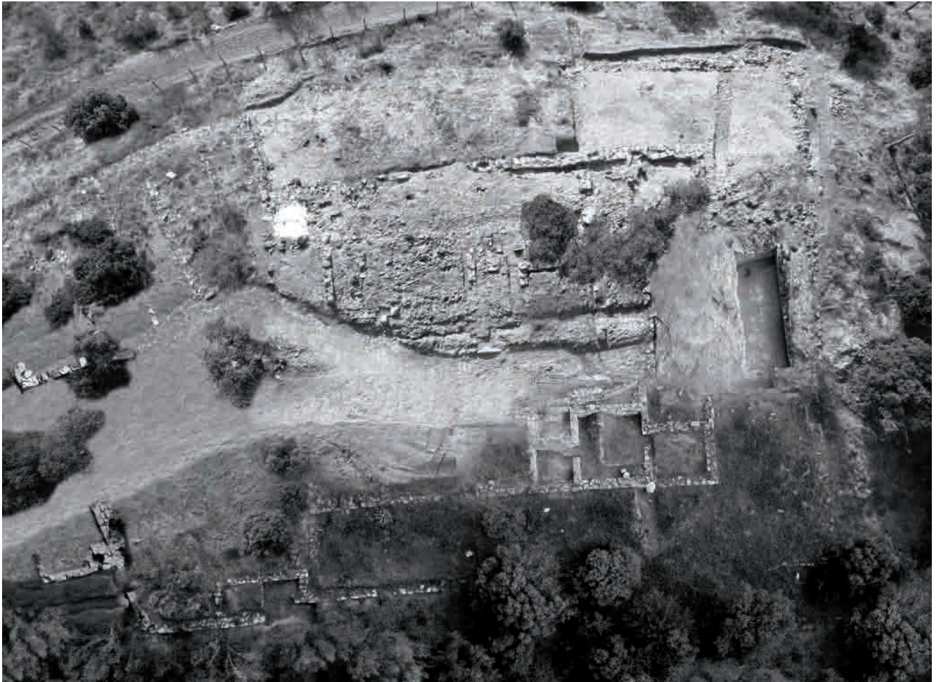
Figure 5. View of the Can Tacó site (Montornès del Vallès) dating from the 2nd century BC, currently in the process of excavation.

roads. The main part of the building was a quadrangular body measuring 750 square metres, and the entire complex was surrounded by a perimeter wall with an entrance gateway flanked by a tower. Inside, in addition to this main body, there was also an open area, several service areas that might have housed a small garrison, and a large cistern built with the most advanced Roman technology of the day (Fig. 5).