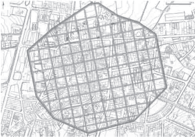
Figure 6. Iesso (Guissona): Interpretative scheme of the wall and the urban layout of the city drawn up from the information available on its archaeological topography, and superimposed on the layout of the town of Guissona today.

hypothesis about the general features of its urban layout. The northern boundary of the urban perimeter has been established with confidence thanks to the fact that part of the wall was uncovered through the excavation. For the western and southern boundaries, an analysis of aerial photographs and plot maps combined with the information provided by the archaeological remains documented have enabled us to sketch a proposed layout, as it seems