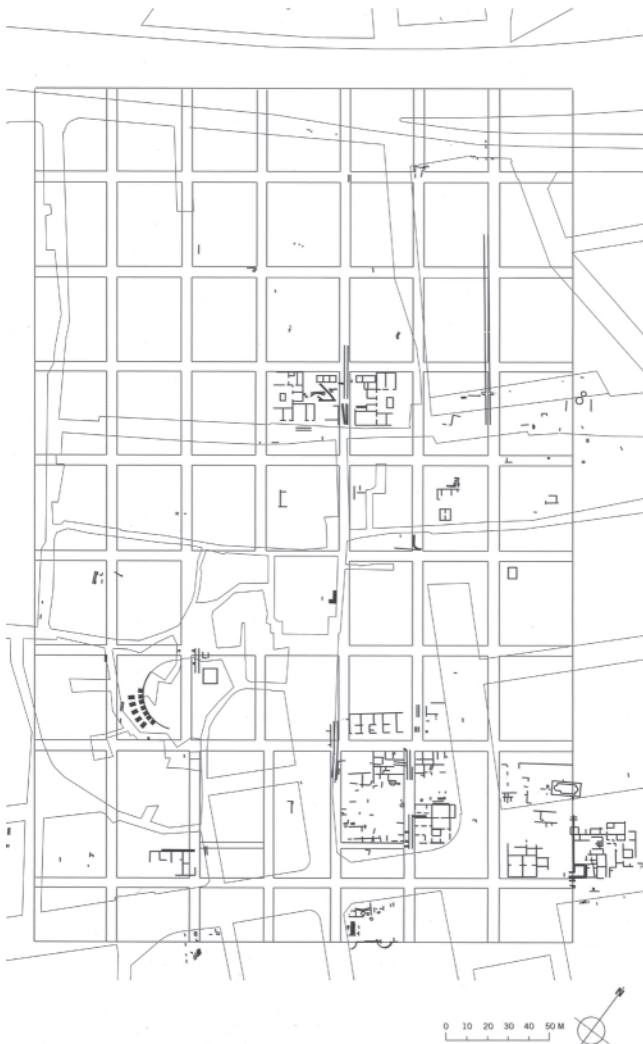
Figure 4. General layout of the archaeological remains documented in the Roman city of Baetulo (Badalona), with the interpretative hypothesis of its urban layout.

The city, located very close to the sea, rose up on the side on a slight elevation with a gentle slope facing southeast but an abrupt drop-off at the start of the beach. This topography determined the structure of the oppidum , which was naturally divided into a lower part with no possibility of directly connecting with the beach, and an upper part built on this slope. The forum, located in the centre, must have been in the upper part near this drop-off, probably seeking a dramatic effect and taking on the role of articulating the different zones in the city. The upper part appears to be a residential area where most of the houses documented to date are located. In contrast, the lower part seems to have been set aside for more communal purposes: bath buildings located on the far southeast of the premises, just like in Iluro, several tabernae (shops) and the remains of other buildings which should probably be interpreted as markets or warehouses have all been documented. The coastal