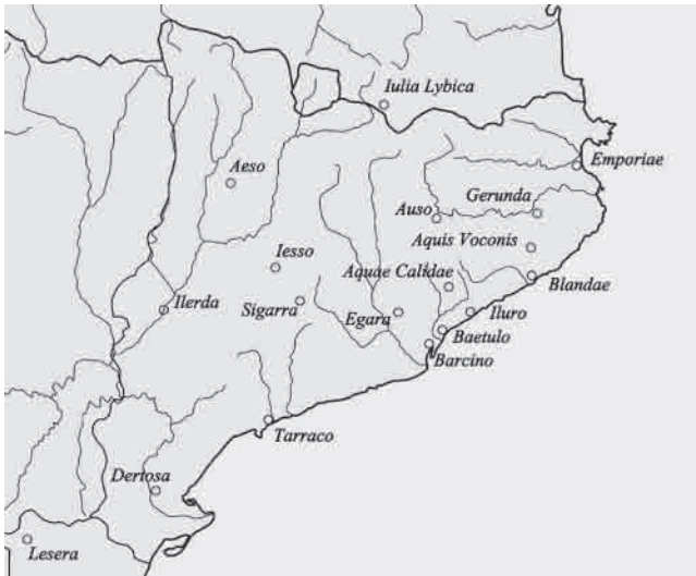
Figure 1. Map of Catalonia with the location of the main cities in the Roman period: Aeso (Isona), Ilerda (Lleida), Dertosa (Tortosa), Iesso (Guissona), Sigarra (Els Prats de Rei), Tarraco (Tarragona), Egara (Terrassa), Barcino (Barcelona), Baetulo (Badalona), Iluro (Mataró), Blandae (Blanes), Emporiae (Empúries), Gerunda (Girona), Auso (Vic), Aquis Voconis (Caldes de Malavella), Aquae Caldae (Caldes de Montbui) and Iulia Lybica (Llívia).

the documentation available. “Studies on cities, based primarily on archaeological documents,” he used to say, “are the outcome of many years and teams. Supporting or refuting aspects we have mentioned now entails years and years of work.” 2