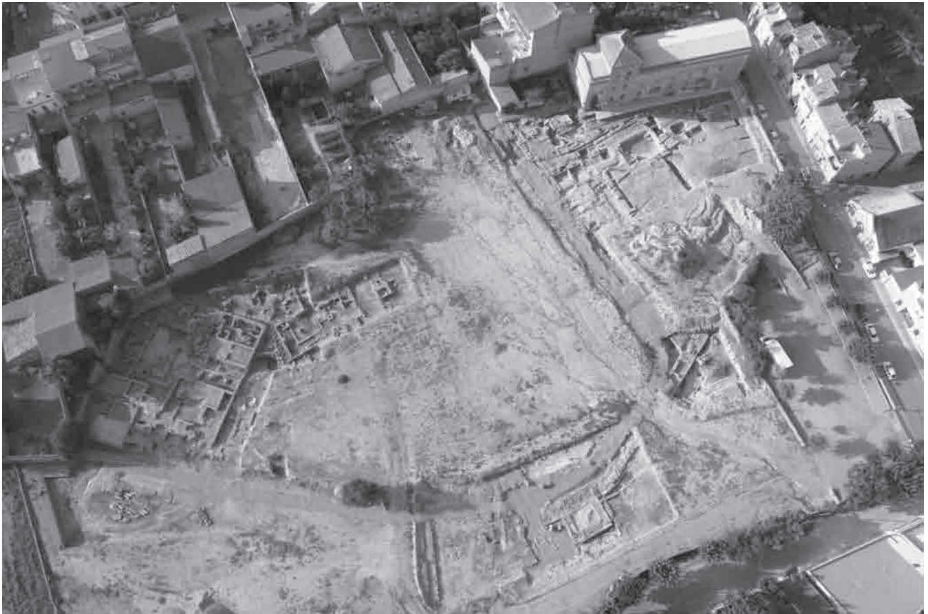
Figure 7. Overall view of the Archaeology Park of Guissona in the process of excavation, with the remains of the north wall, the public baths and numerous houses and streets from the Roman city of Iesso (Guissona).

By combining this information with the possible perimeter, a hypothetical general schema was proposed that