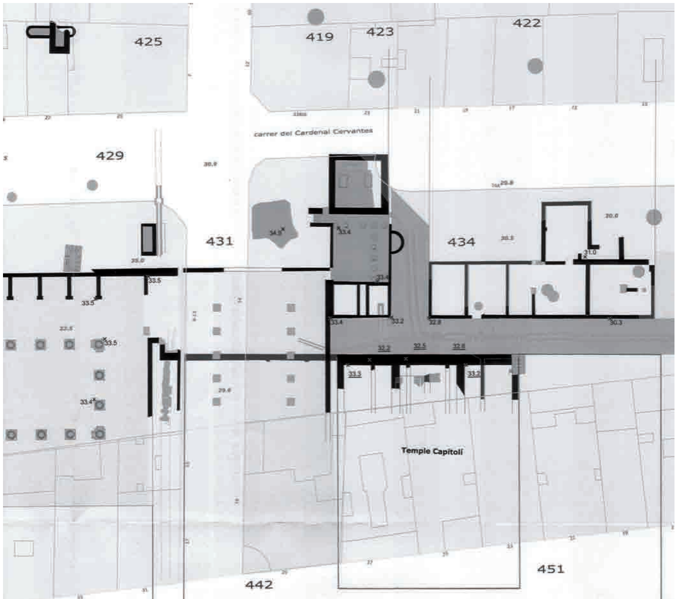
Figure 10. Tarraco (Tarragona): Interpreted layouts of the remains of a possible Capitoline temple and its immediate environs (from Macias et al. , Planimetria... op. cit. plate 10).

only if formulated from a functional standpoint: the territory and the political and military situation in which the programme must have been applied were quite different to the atmosphere in which that ancient model emerged. However, adaptation to the needs and peculiarities of the setting in which they acted must have led to the adoption of some similar solutions. Furthermore, we cannot discard the possibility that the memory of the old model still survived.