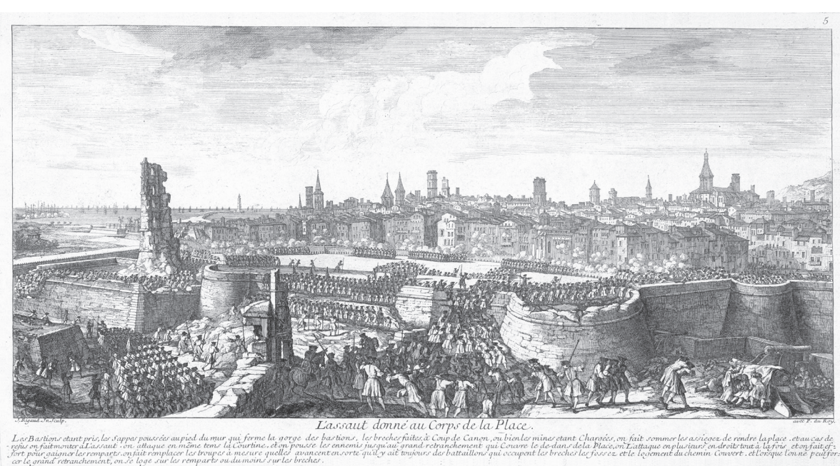
Figure 4 a,b,c. The Siege of Barcelona, 1714. Engravings by Jacint Rigaud (Historic Archive of the City of Barcelona)