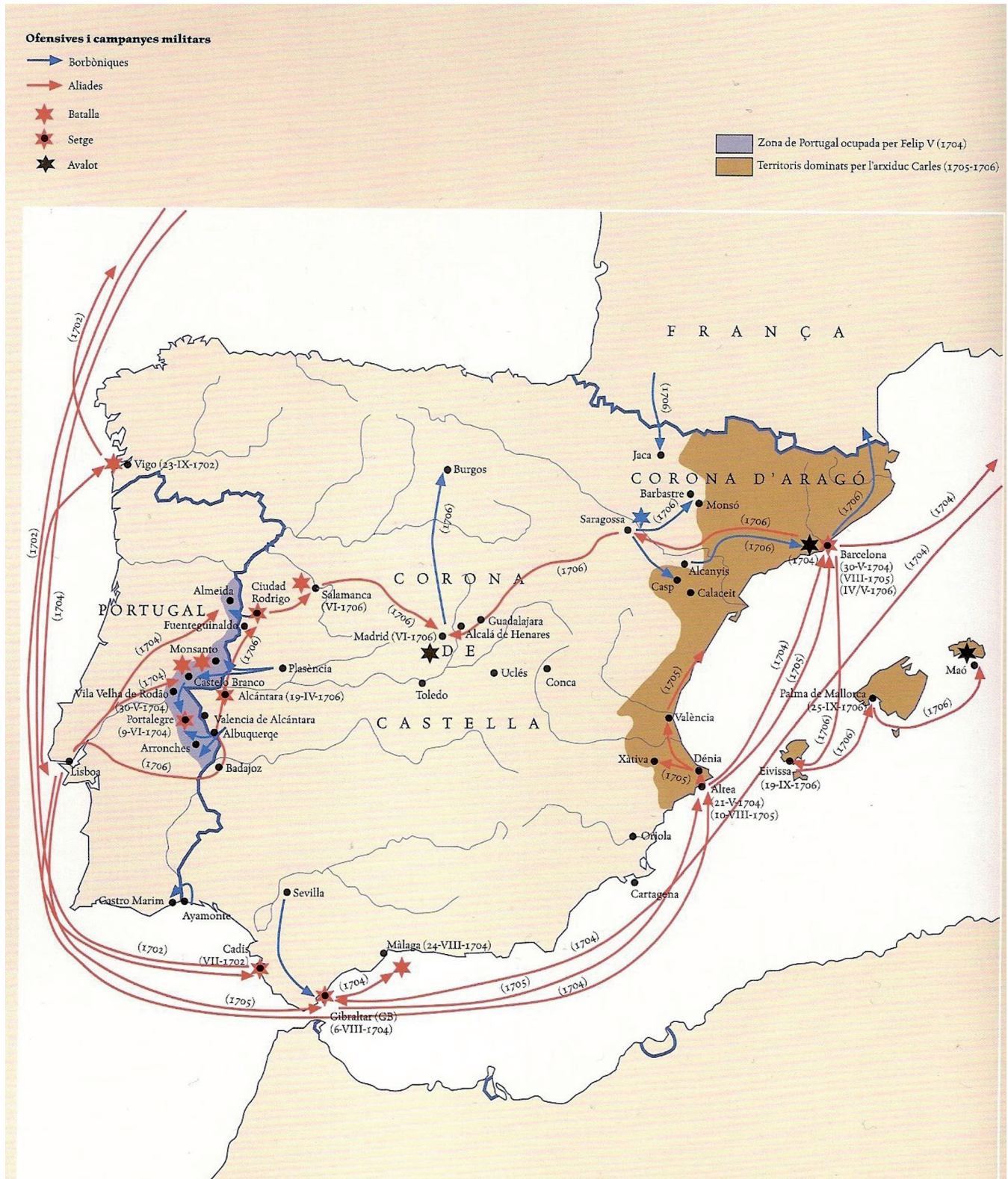
Figure 2. Map of the War of the Spanish Succession, 1702-1706 (from Catalunya i la Guerra de Successió . Museu d'Història de Catalunya, Barcelona 2007).

pressions in the country where, in theory, the grievance was supposed to be resolved. The activation of the Portuguese front with Charles III's arrival in Lisbon had ended in utter failure. And the allies' indisputable naval hegemony on the Iberian coasts had only secured Gibraltar, which became like a presidium with its back turned on