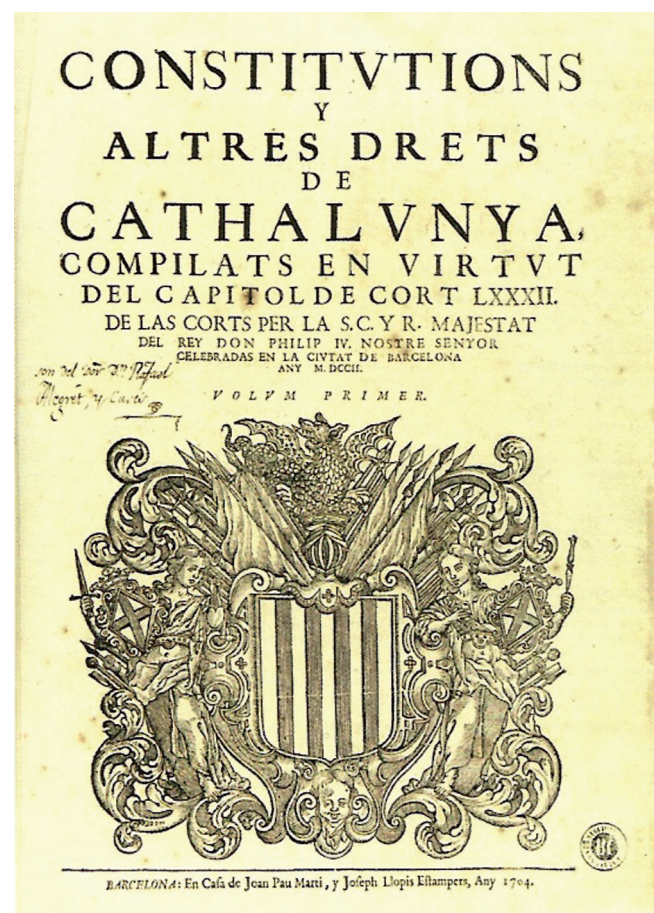
Figure 1. Minutes of the General Court held in Barcelona between 12th October 1701 and 14th January 1702 chaired by King Philip IV and V of Spain in Catalonia.

Outside the Francophile party in the Madrid Court, public opinion in the different Spanish kingdoms could not welcome the choice of a French candidate as their sovereign with open arms. And yet, this is what can be deduced from Charles II's will. It should be borne in mind that the hostility between the Spanish monarchy and France had been constant throughout the previous two centuries. And the same could be said of the rivalry between the Austrians and the Bourbons, and two dynasties that vied for European hegemony throughout the entire 17th century. To some extent, after Westphalia (1648), the ascent of one of Louis XIV's direct descendants onto the Spanish throne cemented the definitive victory of both France and the Bourbons in that drawn-out conflict.