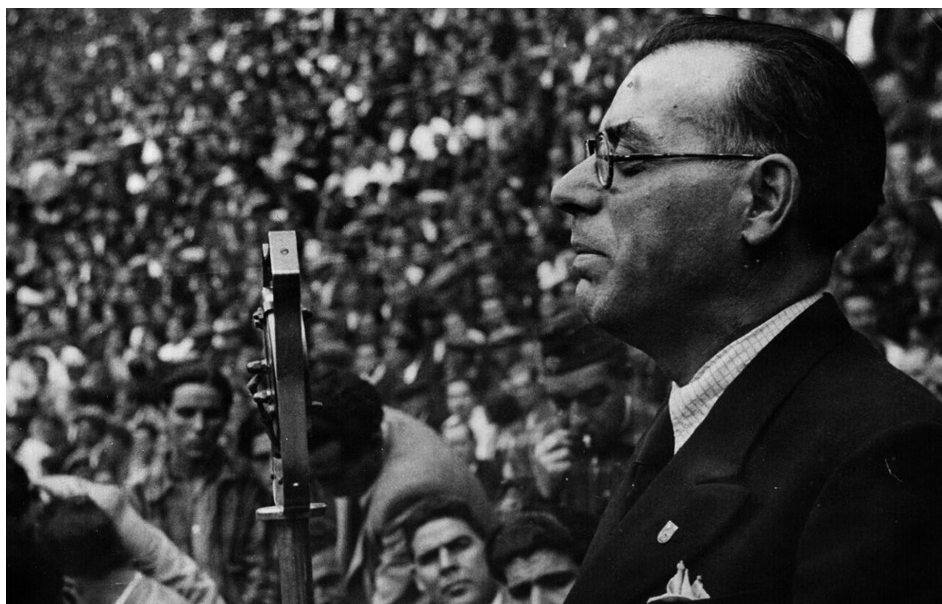
FIGURE 2. Joan Comorera, general secretary of the Unified Socialist Party of Catalonia at a rally in 1936.

The members of the PSUC were proud that a Catalan party that was formally independent was directly recognised by the Communist International, but in reality the latter did not see it as the Catalan national party but as the exemplary forerunner of the desired Spain-wide unification of the PCE and the PSOE, a totally unlikely unification that was only achieved with the union of the UGT and the socialist and communist youths. 20 On the other