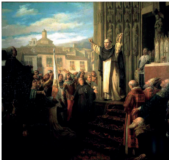
FIGURE 1. Painting by Dióscoro Teófilo Puebla, El Compromiso de Caspe , 1867