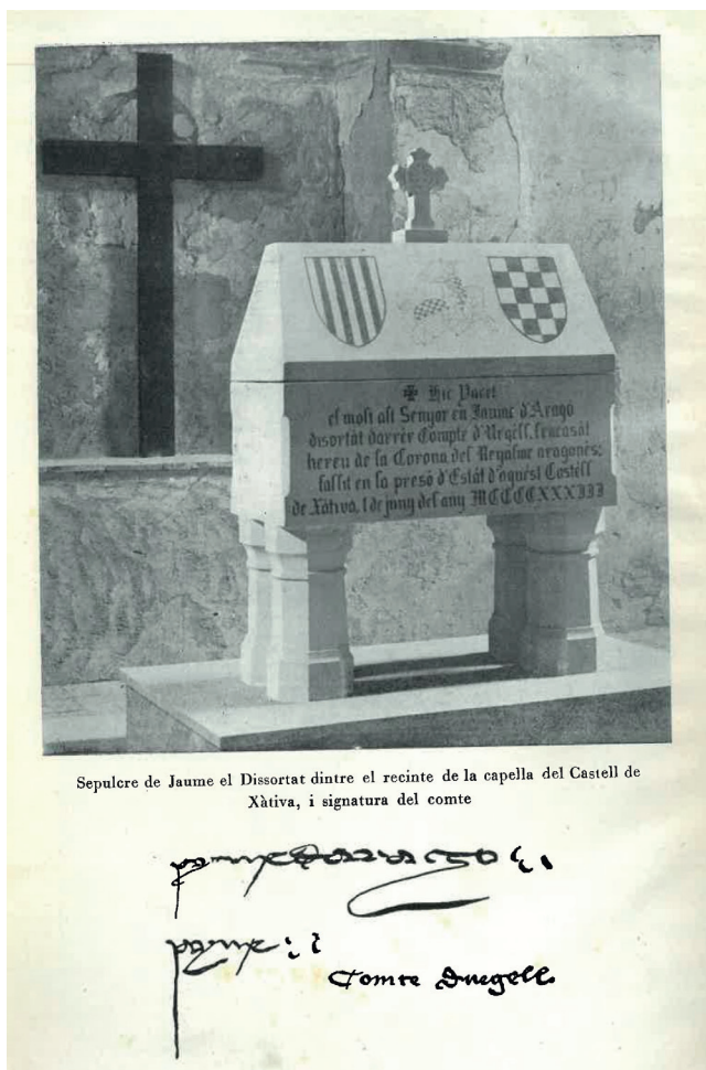
Sepulcre de Jaume el Dissortat dintre el recinte de la capella del Castell de Xàtiva, i signatura del comte

James of Urgell tried, in turn, to dispute the Alcanyís agreements so that the delegates and supporters gathered in Mequinensa would not attend, while the Vilaragut family tried to restore an Urgellist parliament in Alzira; however, neither option was heeded and they ended up dissolving. Despite the failure, they had not fully discarded the military route because on 24 April 1412 the Urgellist troops beat the Centelles faction in a battle that left 500 dead near Onda, leading to a request for more Castilian troops. Meanwhile, Anton de Luna continued to stir up havoc in Aragon to prevent the protocol agreed upon in Alcanyís from coming to fruition. He even threatened to attack Casp, an unattainable goal considering that after the battle of Morvedre the village was surrounded by Castilian troops to the north and south, and it was protected inside by a sizable guard of Aragonese and Catalan sol-