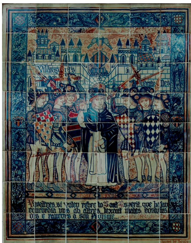
FIGURE 3. Ceramic altarpiece on the back façade of the cathedral of Valencia, unveiled in 1955: Saint Vincent Ferrer's Pacification of the Vilaragut – Centelles Factions.

The spread of the factions to Cullera and Xàtiva ended up giving rise to a major clash in 1404 called the battle of Llombai, a realm of the Centelles family, in which noblemen, knights, citizens and a large number of armed tradesmen affiliated with each of the two sides participated. By January 1406, the situation had deteriorated so much that the jurors themselves asked the queen for the monarch's presence, and the viceroy drafted 1,000 troops. Striking measures were taken with this force which undermined the furs , and they consequently earned the opposition of the juries and the council. The jurors' own partiality with the factions forced them to be suspended from their profession, expelled from City Hall and banned from entering it, and it was placed under the armed vigilance of the viceroy for almost one month. Finally, on 5 June 1406, King Martin took over the government and appointed the jurors with the pretext that this was the only way to pacify the citizens.