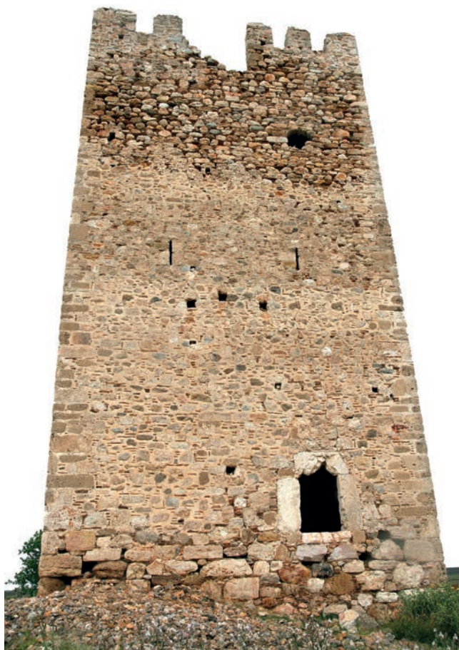
FIGURE 4. Tower of Vravronas, in Attica, seen from the east.

they did exercise effective control in some cases). However, we cannot reject the possibility that some of them may have been built at strategic points to monitor the movements of men and goods, such as the towers in Livadostra and Antikyra, in the Gulf of Corinth, or that they may have also been used in times of instability to protect their owners and, more generally, the civilian population working in their fiefdoms. 29