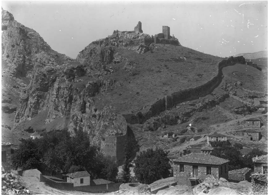
FIGURE 2. Castle in Livadeia.