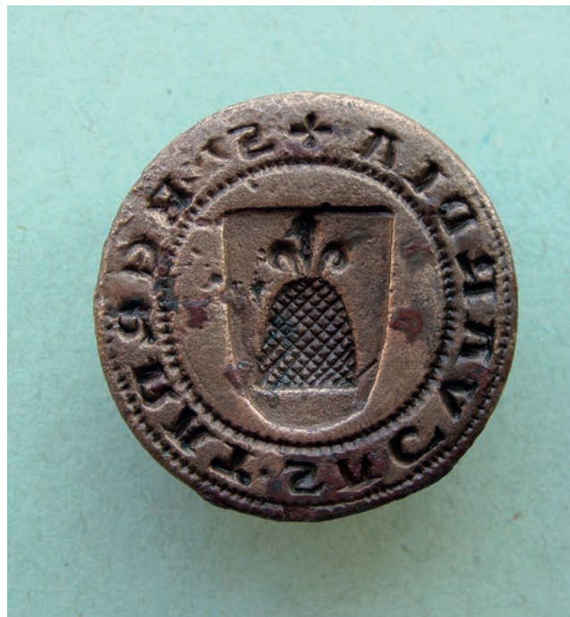
FIGURE 5. Mould of the seal of Bernat Saguàrdia (Regional Historical Museum. Shumen [Bulgaria]).

One example is a hamlet which spreads at the feet of the tower in Panakton, in Boeotia, which was excavated in 1991-1992 and again in 1999 by the American Archaeology School of Athens. It must offer a picture quite similar to the majority of Greek villages in Attica, Boeotia, Phthiotis and Phocis under Catalan rule. The objects found there are simple and not very valuable (with the exception of several items found in the church), which leads us to