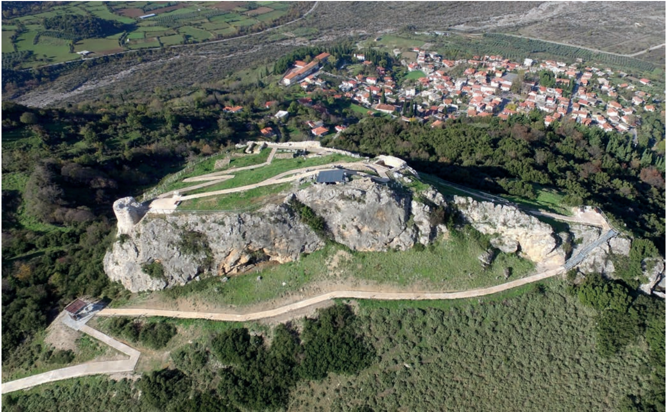
FIGURE 3. Aerial view of the castle of Neopatria (Ypati) after being restored, with the current village at its feet (Ephorate of Antiquities of Phthiotida and Evrytania. Ministry of Culture and Sports of the Greek Republic).

it until 1388. The Propylaea – the splendid, unfinished construction attributed to Mnesikles which serves as a gateway to the monumental complex on the Acropolis – became the duke's residence, and an upper storey was built on it, along with a private chapel with a single nave dedicated to Saint Bartholomew, which was built atop the so-called Cistern of Justinian. The Parthenon continued to be used as a basilica dedicated to the Virgin Mary during the Catalan era, with the square tower on its far southwest side above the pediment and roof used as a bell tower, while the Erechtheion was turned into the residence of the Latin archbishop. Today, virtually no traces remain of these changes in architecture and use (because of the drive to restore the structure it originally had during the times of Pericles), which gave it the appearance of a true fortress within the fortress that the Acropolis itself was. 28