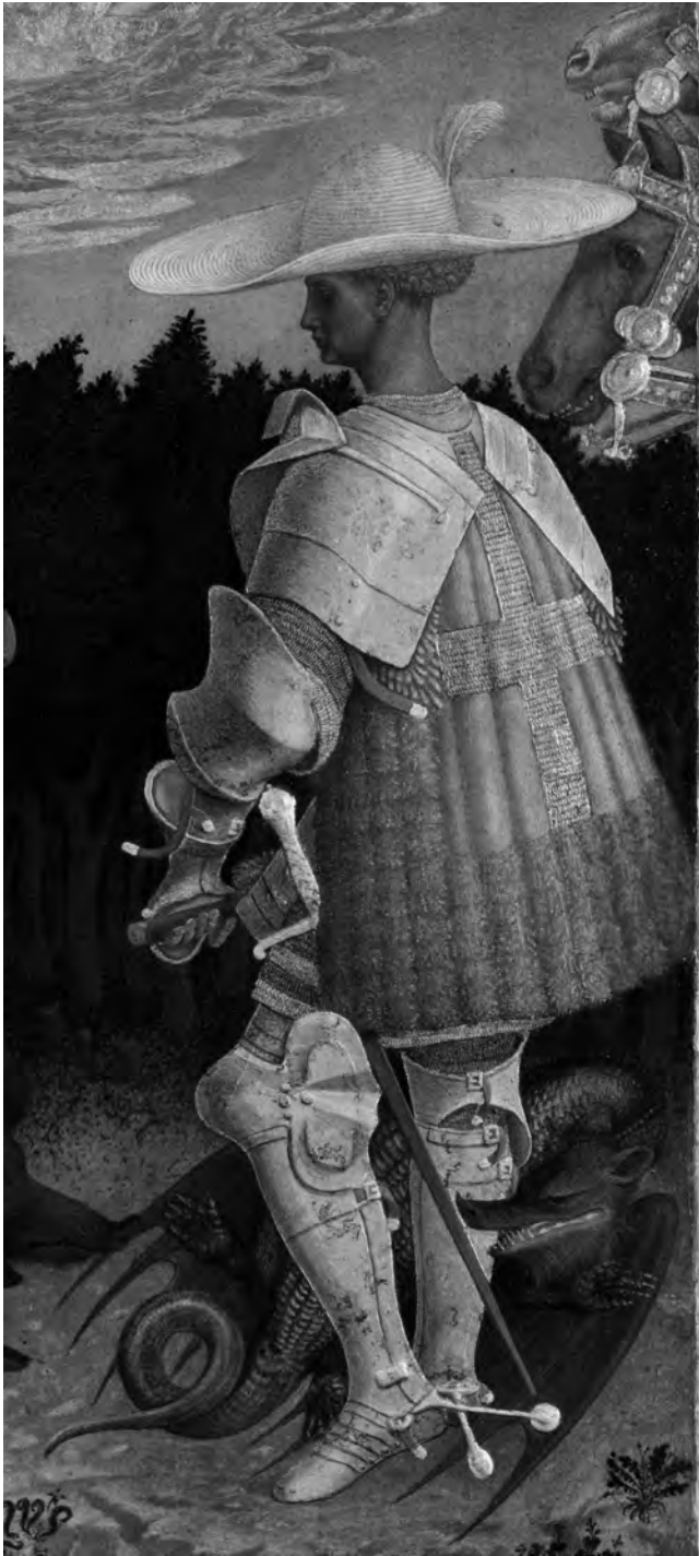
FIGURE 2. Italian knight, which illustrates the Renaissance tone of Curial e Güelfa . Close-up from “Apparition of the Virgin to Saints Anthony Abbot and George” by Pisanello (Naples or Ferrara (?), 1445).

(1276-1285) and, because of his marriage to Constance of Hohenstaufen, King of Sicily as well (1282-1285).