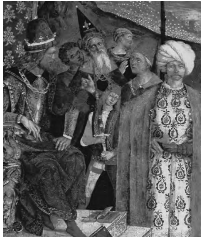
FIGURE 1. Presumed portrait of Jem Sultan, son of Mehmet II, which illustrates Europe’s fascination with the Oriental exoticism of the Turks, as found in the Història de Jacob Xalabín . Close-up from “The Disputation of Saint Catherine of Alexandria” by Pinturicchio (Vatican City, Borgia Apartment, ca. 1494)