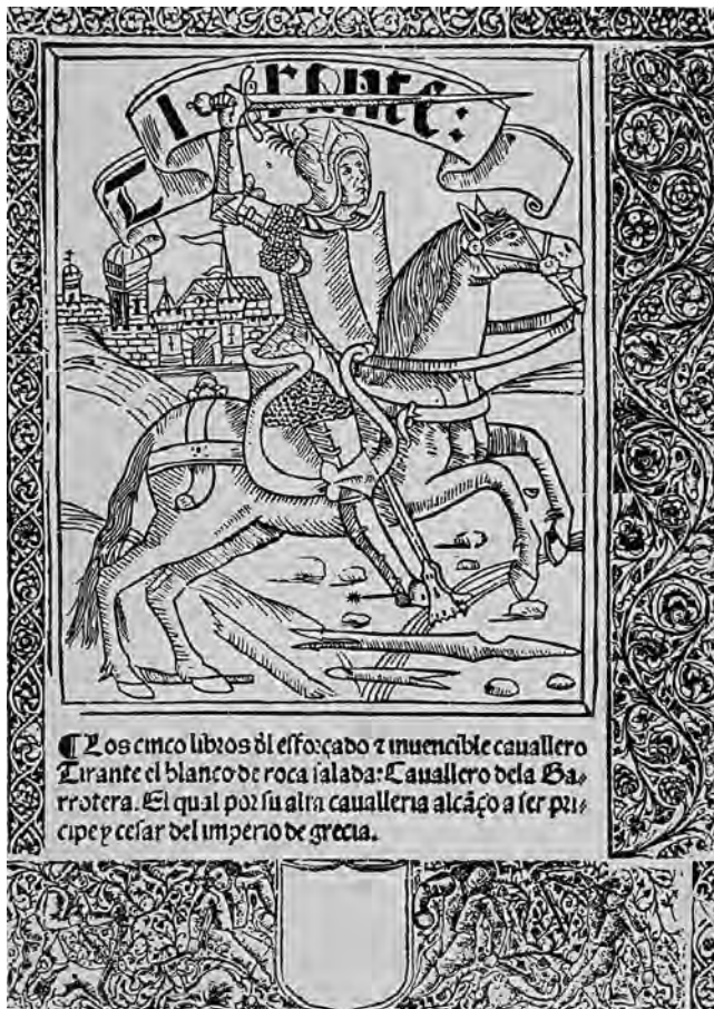
FIGURE 3. Cover of the first Castilian version of Tirant lo Blanc (Tipografía de Diego de Gumiel, Valladolid, 1511), without either the author's name or the original language. Cervantes drew inspiration from this version.

mines materials from Guillem de Varoïc , a chivalric tale based on the Anglo-Norman Guy de Warwyck , which was inspired in turn by Ramon Llull's Llibre de l'orde de cavalleria . It recounts the story of a knight, Guillem de Varoïc, who retires to a hermitage, from whom Tirant learns the principles of knighthood. Diafebus, Tirant's friend, tells Guillem de Varoïc about the festivities organised by the King of England over his marriage, and how Tirant was dubbed a knight after several unique combats. The second section of the romance (chapters 98-115) starts when Tirant and his friends travel to Brittany and France. Prince Philip decides to accompany Tirant on his siege of Rhodes with the assistance of the King of Sicily to release it from the Turkish peril. Back in Sicily, Philip's marriage with Princess Ricomana is celebrated. Tirant conquers Tunisia, assisted by the kings of Sicily and France.