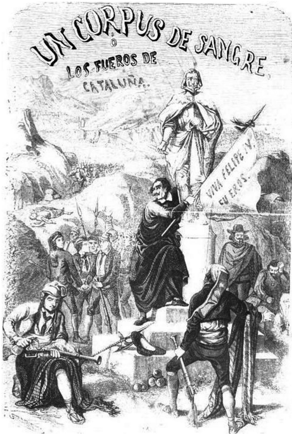
FIGURE 1. First plate in the edition of Un corpus de sangre .