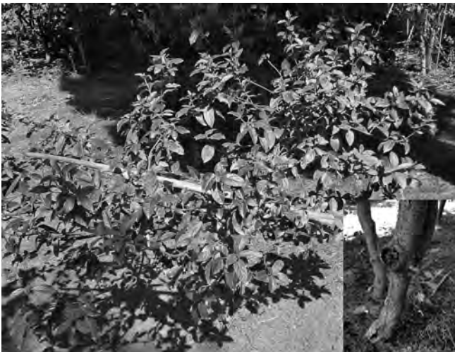
Figure 2. Viburnum sp. Workers Cardiocondyla obscurior Wheeler were foraging on foliage. Inset: trunk of Viburnum sp. where a nest of Cardiocondyla obscurior occupied the dead wood inside the bulge. Workers were seen going up and down the trunk. The entrance was at 23 cm from the soil surface.

Two outdoors localities for C. obscurior , both strictly urban, were previously known for continental Spain: 1) VALENCIA: Burjassot (Sánchez-García & Espadaler, 2015). 2) ALICANTE: Alicante (Trigos-Peral & Reyes-López, 2016). The 3 rd locality, here documented (see material and methods), is also urban. In Europe, the species had been detected exclusively indoors in greenhouses from France, Deutschland (Seifert, 2003) and The Netherlands (Boer et al. 2018).