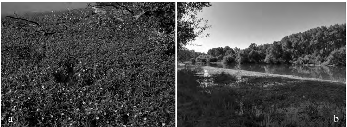
Figure 1. Herbaceous Ludwigia spp. plants in summer 2018: a) L. grandiflora subsp. hexapetala , in the Ebre River, at Amposta; and b) L. peploides subsp. montevicensis , in the Ter River, near Colomers.

was launched to collect samples from the populations of several Catalan basins. In the Ebre River, there was a population (Fig. 1a), not recognised in our previous study, found in the main course of the river, in an area bordering the Ebre Delta Natural Park. An analysis of the morphology of various specimens determined that it was Ludwigia grandiflora subsp. hexapetala (HGI 23947). This taxon naturalised in the Lez River in Montpellier (France) in 1826 (Dandelot, 2004), from where it has expanded its range substantially, becoming one of the invasive aquatic plants with the greatest impact (Ruaux et al. , 2009), with similar biology and dynamics to L. peploides subsp. montevicensis . The presence of L. grandiflora subsp. hexapetala in Catalonia, and specifically in the area of the Ebre Delta, which is geographically more remote from the populations found in France than other basins, raises several doubts about its introduction in Catalonia, the transport vector, and the population it originated from, as it could have come from either European populations or have originated from a native American population.