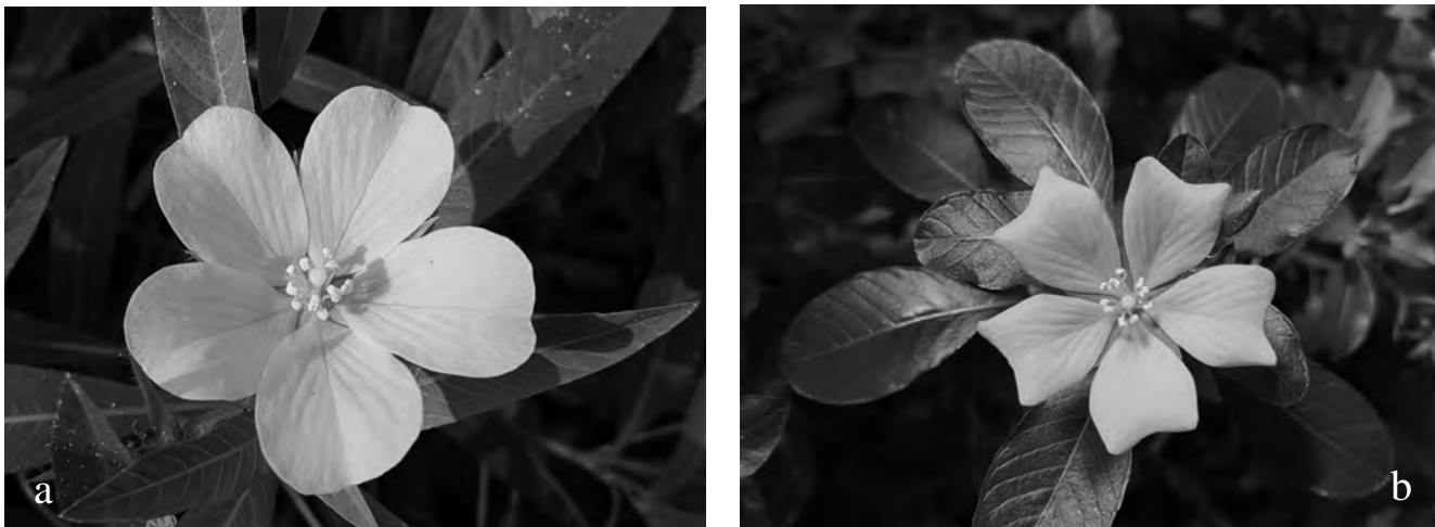
Figure 3. Flowers of a) L. grandiflora subsp. hexapetala from Amposta, and b) L. peploides subsp. montevidensis from Girona.