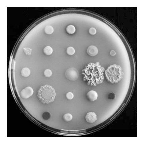
Fig. 1 A replica plate used in the nutritional characterization of large numbers of yeast isolates

This second principle of the Phaff School is a quote from a review paper on yeast ecology [13]. There is more to this statement than meets the eye. First, it implies a