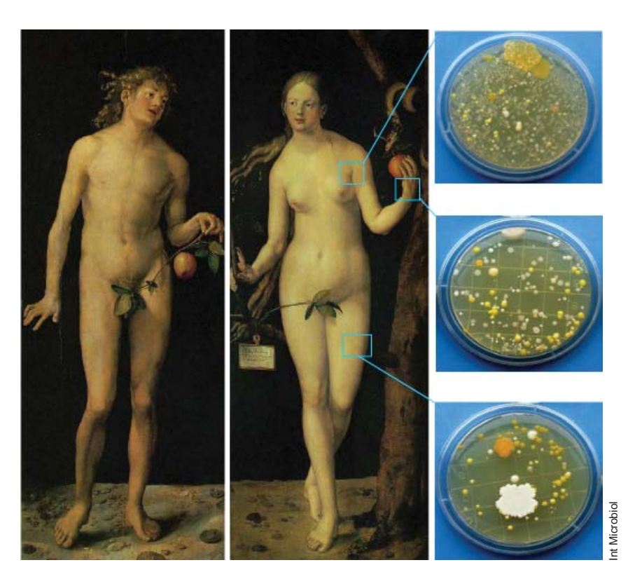
Fig. 1. Interactions between microorganisms and the human body. Left: Adam and Eve, by Albrecht Dürer (1471–1528; Prado Museum). Right: Three plates with nutrient medium showing the growth of microorganisms normally present on the armpit, palm and leg of a healthy person.

Higgs boson. The excitement was well-justified, as this was the last missing cornerstone of the Standard Model, the best theory we have so far to describe the building blocks that make up the Universe and how they interact with each other. But aside from being an important year for particle physics, from the Encyclopedia of DNA Elements (ENCODE)