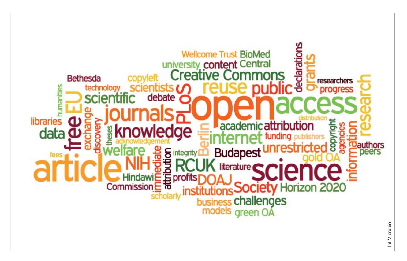
Fig. 3. Word cloud of topics related to Open Access.

In July, the European Commission outlined measures to improve access to scientific information and made OA to peer-reviewed publications the default setting for Horizon 2020 (the EU's Framework Program for Research and Innovation), as a means to boost Europe's capacity for innovation and to provide citizens with quicker access to the benefits