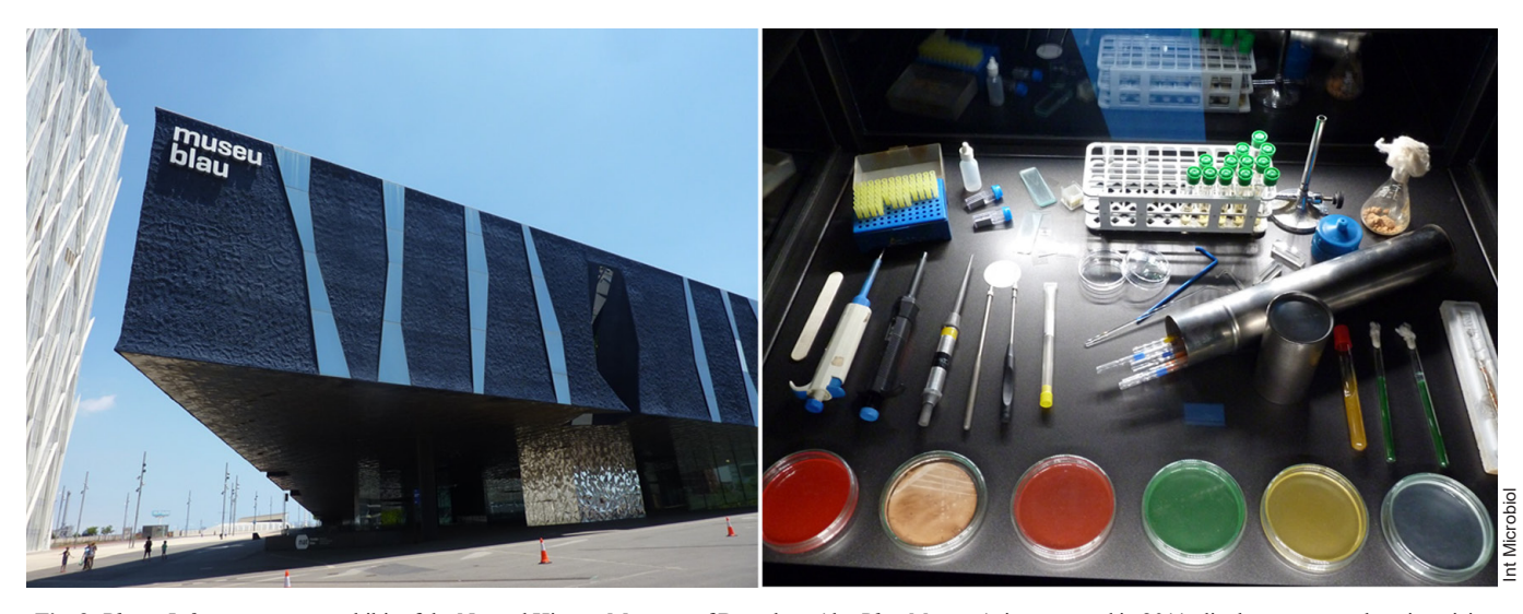
Fig. 3. Planet Life , a permanent exhibit of the Natural History Museum of Barcelona (the Blue Museum ), inaugurated in 2011, displays a comprehensive vision of the World of Microbes and the major role that microbes have played in the history of Earth and the biosphere.

the present ecosystems must be explained to visitors.