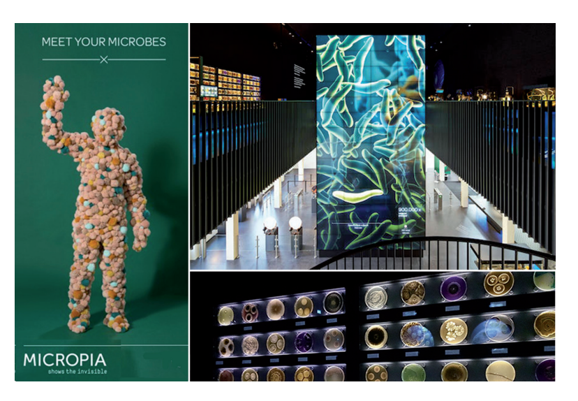
Fig. 4. Micropia , a permanent large exibit of the world of microbes in the Amsterdam zoo inaugurated in 2014.

these new journals should be carefully evaluated by researchers looking for a place to publish their work. The majority of experienced researchers have a list of benchmark journals that they rely on to stay current in their fields. Such lists offer a way to manage the enormous number of scholarly publications available in print and, especially, via the internet. But whether we, as researchers, can and do benefit from this huge amount of information is unclear, as is the impact on science of this plethora of highly specialized journals and their dilution of potentially important knowledge. Today the motto of "publish or perish" still holds true and researchers continue to