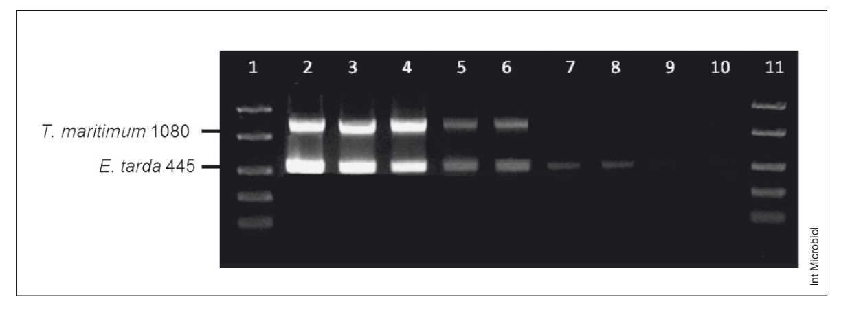
Fig. 1. Sensitivity of the mPCR protocol as determined using purified DNA from serial dilutions of mixed cultures of Edwardsiella tarda ACC35.1 and Tenacibaculum maritimum NCIMB2154 strains. Lanes 1 and 11: Fast Ruler low range DNA ladder (50–1500 pb); lanes 2–10: dilutions ranging from 10<sup>9</sup> to 10<sup>1</sup> cells/ml from E. tarda and T. maritimum . Numbers on the left indicate the specific amplified product in bp.

The the mPCR protocol was also tested using DNA templates from fish tissues seeded with different concentrations of the two pathogens. The results demonstrated the presence of these bacteria in kidney, liver, and spleen. The detection limits in these assays were the same, regardless of the type of tissue: 2 \times 10^5 \pm 0.2 CFU/g for T. maritimum and 4 \times 10^5 \pm 0.3 CFU/g for E. tarda (200 and 400 cells per PCR tube, respectively; Fig. 2). Moreover, large amounts of E. tarda or T. maritimum (10<sup>7</sup> CFU/ml) had no effect on the detection limit of either pathogen; the values were of the same order of magnitude as described above (10<sup>5</sup> CFU/g; data not shown).