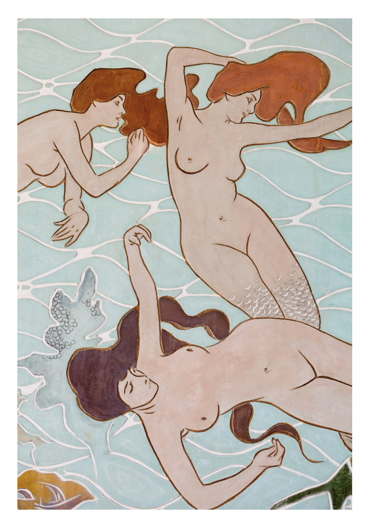
The Garden of the Mermaids (R. Casas, 1904). Walls of the dinning room of the Fonda España.

painted about a dozen portraits in oil. He went to Miami and from there to Cuba. His intention was to visit friends and also go to Matanzas, the province where his father had lived for many years.