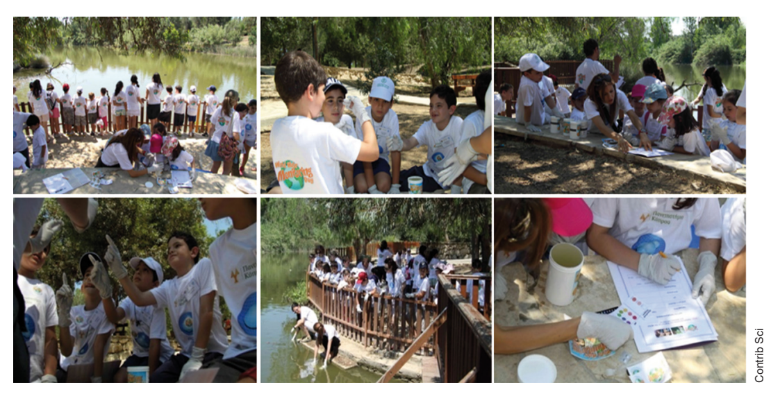
Fig. 4. World Water Monitoring Day in Cyprus.

sessment of multi-component chemical mixtures to humans and the ecosystem (TOMIXX, PENEK/0609/24, 2010–2012).