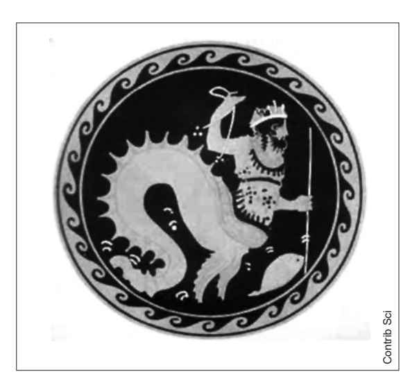
Fig. 2. Nireas or Nereus in ancient Greek mythology.

Of course, the aforementioned measures are a relatively common practice for many arid-weather Mediterranean and southern European countries, which have over the years been faced with extended periods of drought and short supplies of water. However, the case of Cyprus is of particular interest: Cyprus currently has the largest number of dams per square kilometer in Europe and the largest storage volume per capita, with over 100 dams and a total capacity of 304 million m<sup>3</sup>. Yet in 2008, after 4 years of drought and increasing water consumption, the Republic of Cyprus was forced to take drastic measures to safeguard diminishing national water reserves and to prepare for worsening drought conditions. These measures included the importation of water by ships from neighboring Greece, the enforcement of an intermittent water supply policy (city residents were provided with water through city water pipelines for about 12 h every 48 h) and the construction of several desalination plants. The intermittent water supply lasted for about 2 years (March 2008-October 2010) and put the country's water reserves (volume and quality), its residents, and its economy under enormous strain.