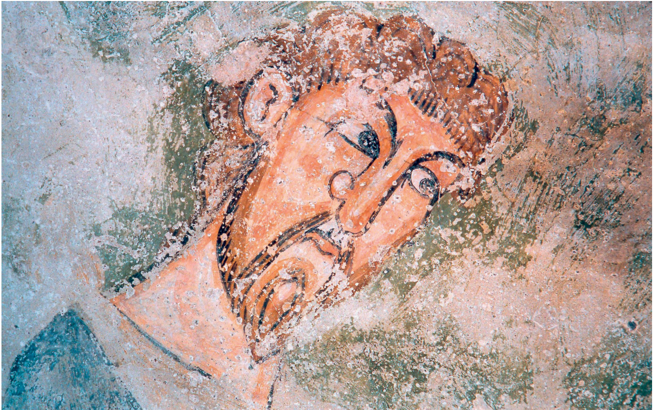
Figure 6. The face of Cain in the scene depicting the Fratricide, paintings from Sant Climent de Taüll, in situ (© Centre de Restauració de Béns Mobles de Catalunya. Photo: Carles Aymerich).

be related to Santa Maria de Taüll. In these paintings, three different styles converge: a Lombard style, quite different to that of Pedret and yet very high quality; a more expressionistic style; and a third much more rudimentary style, even in the polychromy. They all date from around the same period, which would indicate that painters from different places had joined forces to complete the commission. Something similar holds true in Santa Eulàlia d'Estaon. 33 In Sorpe, the best master is the first one, the author of the Annunciation and the Crucifixion, with a lovely Christ that reflects the mezzo-Byzantine style. 34 This artist also painted the Crucifixion in Santa Eulàlia d'Estaon (MDU and private collection), 35 which is almost identical to the one in Sorpe, where we can note the use of the same patterns, for example. The second master of Sorpe rendered Saints Gervasius and Protasius and the allegorical images on this church's triumphal arches, including the picture of Mary with the Christ Child between the Church and Synagogue, which has been studied by Hélène Toubert 36 (very stylistically similar to the Maiestas Mariae in Santa Maria de Taüll) as well as the Bark of the Church and the banquet of the wealthy man from the parable of Lazarus, which is from a chapel located on the first floor of the belfry. Finally, the third master of Sorpe, the most mediocre one, painted the Eucharistic, theophanic and zodiacal figuration of the arches separating the naves, al-