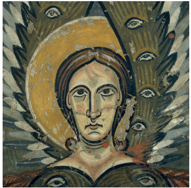
Figure 2. Close-up of the seraphim in Santa Maria d'Àneu, MNAC.

In Catalonia, the Pedret style reappears in an entire series of churches whose decoration dates from the end