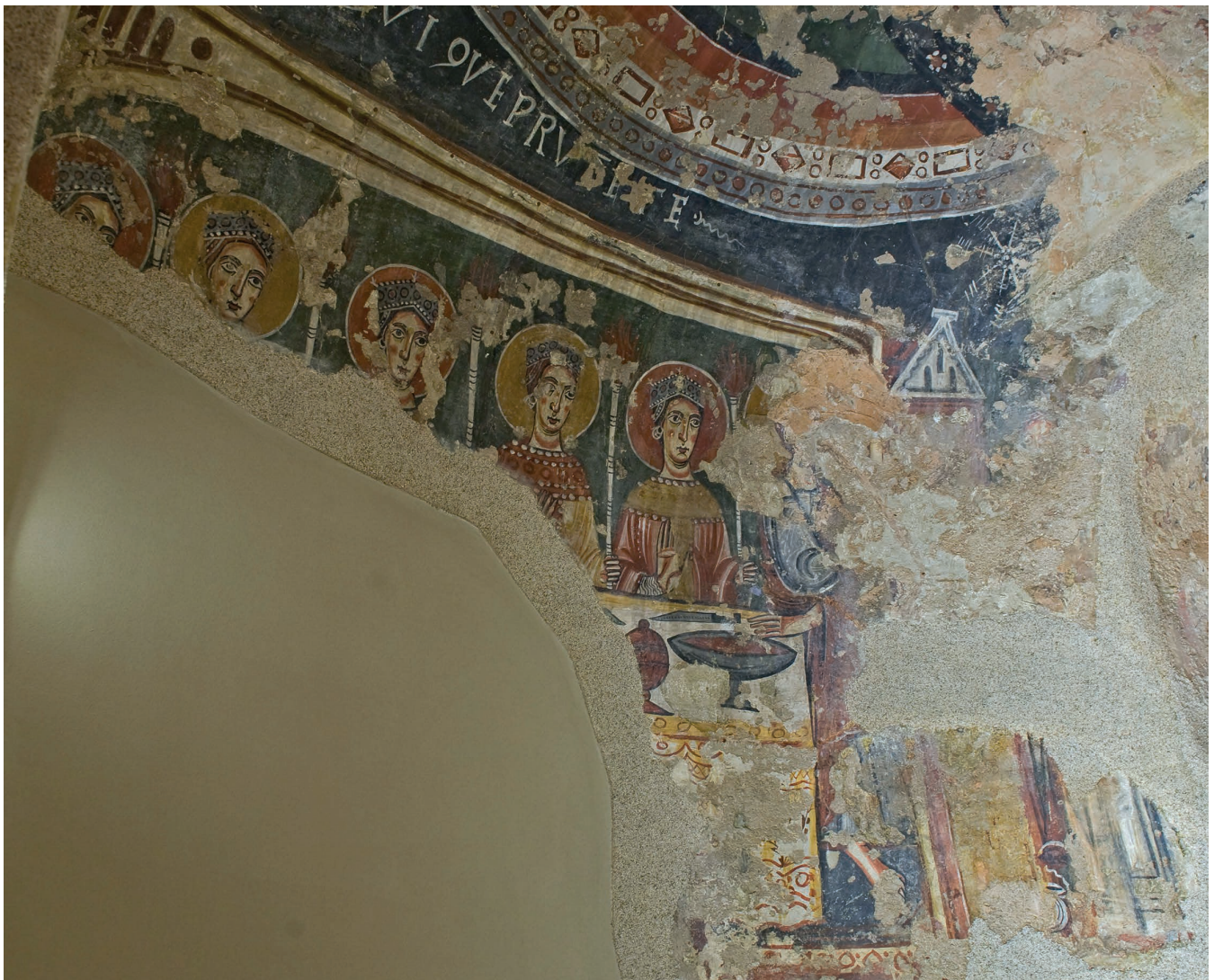
Figure 1. The wise virgins in the southern apse of Sant Quirze de Pedret, MNAC.

However, the style is not the only thing that is extraordinary in Pedret; so is the iconographic programme. 5 The