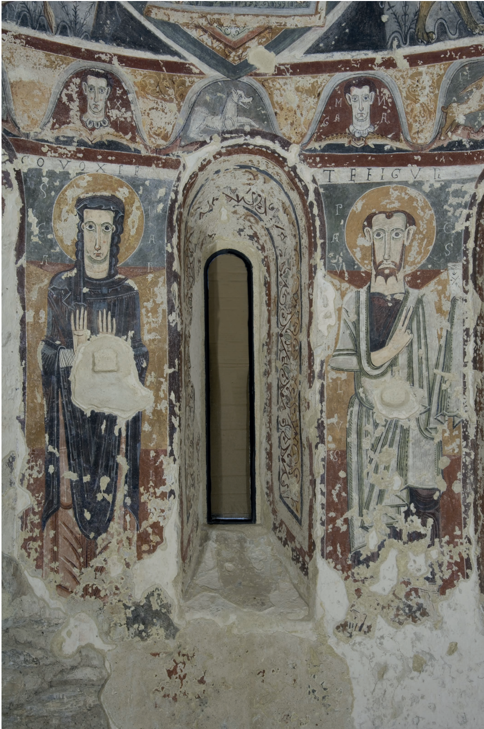
Figure 3. The Virgin Orans and Saint Paul and the “sea of glass”, with the quotation from the Apocalypse in the apse of Sant Vicenç d’Estamariu, in situ (© Centre de Restauració de Béns Mobles de Catalunya. Photo: Carles Aymerich).

sites, which also relates them to the paintings in Sainte-Marie de la Clusa, the ones in St. Martin de Fenollar and the severely damaged remains in Sant Quirze de Colera in the Alt Empordà, which have only recently been discovered and are still unpublished. However, except for this primordial relationship, the frescoes in Mur would still be a unicum if the ones in Sant Miquel de Moror, 23 a church which depended on the canonic church of Mur, had not been conserved, albeit in a highly fragmented fashion.