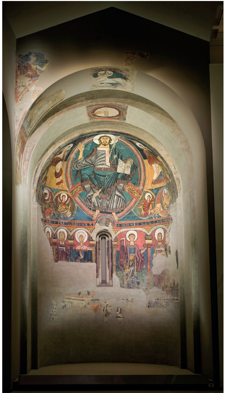
Figure 5. Apse of Sant Climent de Taüll, MNAC (© MNAC – photographers Calveras/Mèrida/Sagristà).

zoomorphic symbols of the evangelists. In all of them, one can note a certain classical influence from Lombard painting. The decoration in the nave, which was painted after the church was consecrated, is by yet another artist, freed from the weight of the Byzantine-Lombard heritage and its ancient naturalism, the Master of the Final Judgement, who imitates the great local masters, both the Master of