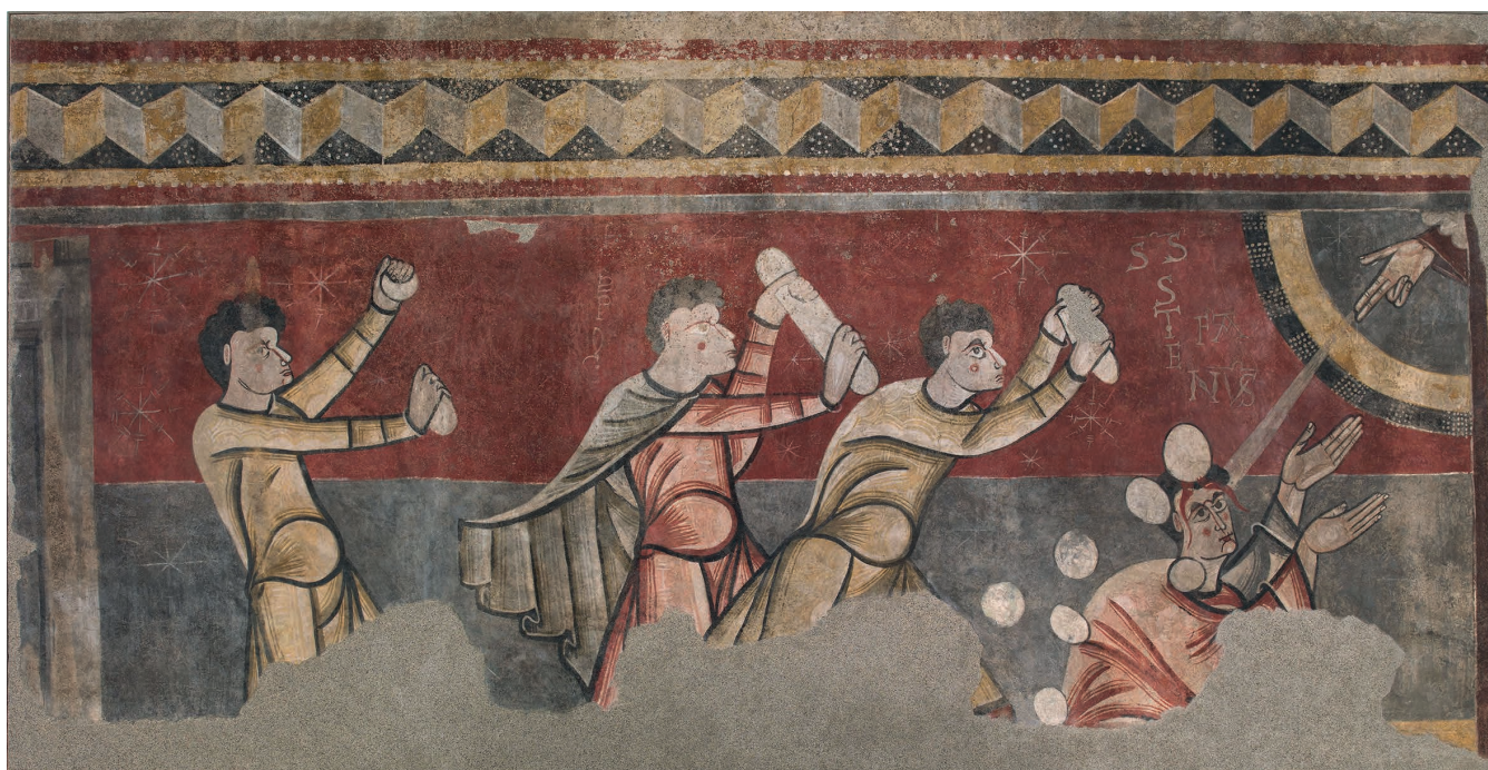
Figure 4. Lapidation of Saint Stephen from Sant Joan de Boí, MNAC.