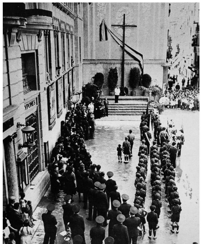
Figure 3. Ceremony in front of La Paeria (Lleida City Hall) in Lleida in memory of the dead of one of the opposing sides in the Civil War.