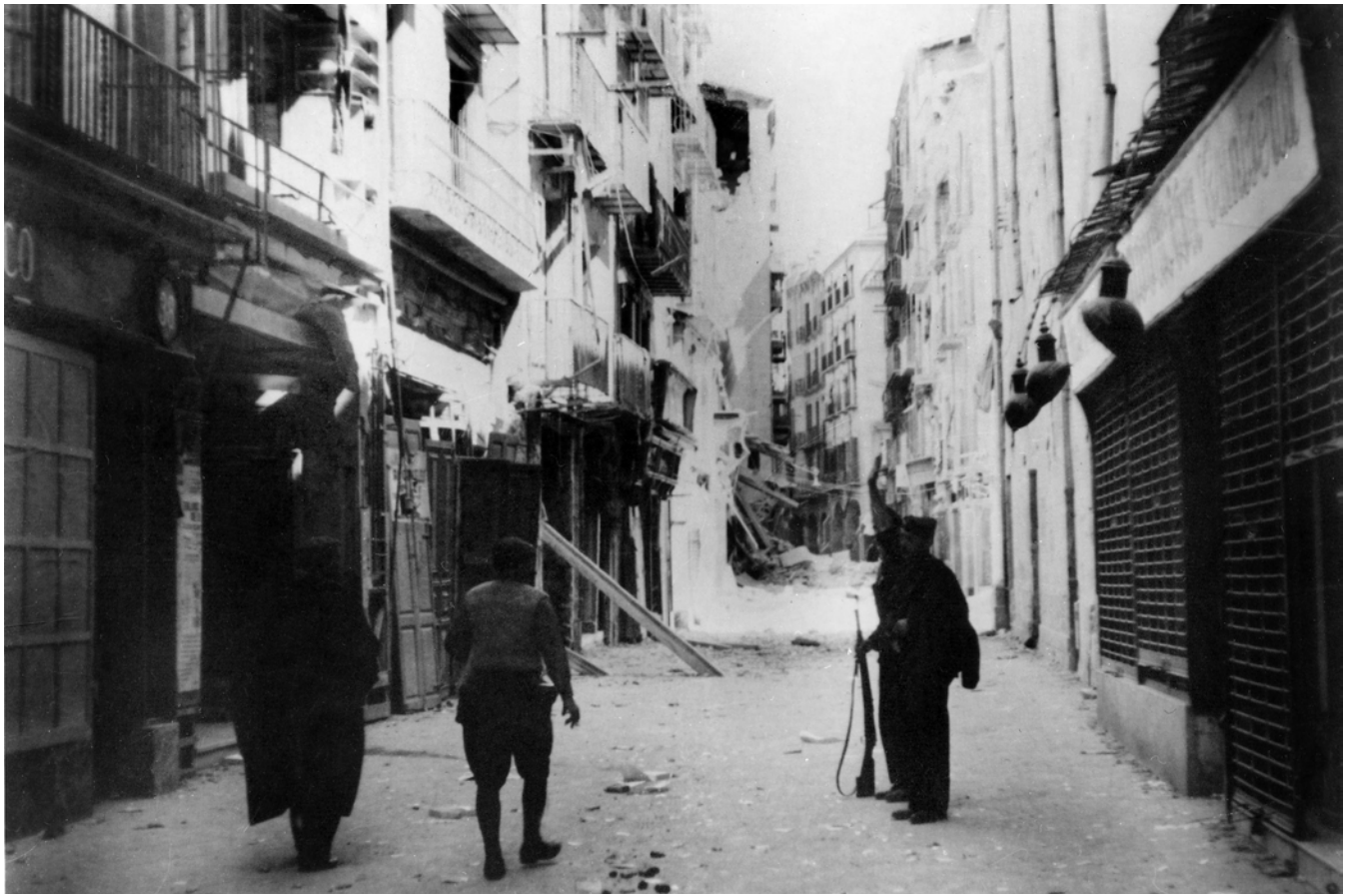
Figure 2. The streets of Lleida when General Franco's troops entered the city. Collection of the Biblioteca Nacional.

tains of Lleida, possibly because at the time it aroused controversy even among the regime's supporters, some of whom tried to exculpate their fellow Francoists on the grounds that Republican women deserved little respect. 11