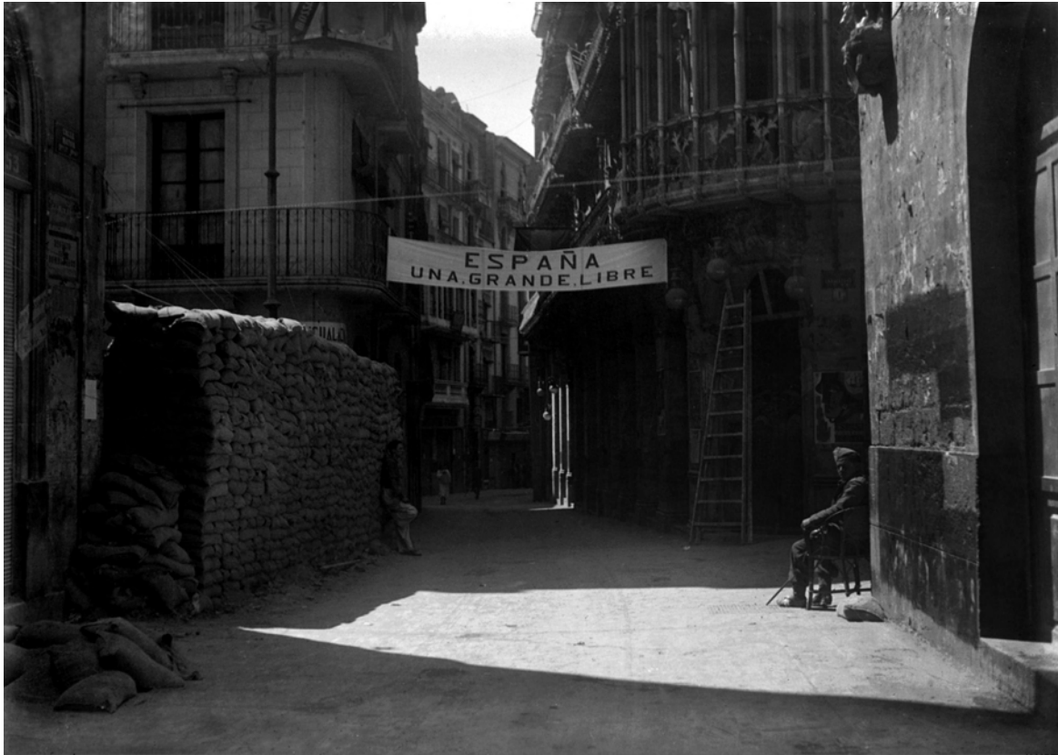
Figure 1. Remains of the barricades erected at the intersection of Carrer Cavallers and Carrer Major when General Franco's troops entered the city of Lleida.

recovered from the surprise, it not only publicly condemned the extremism but attempted to halt it and helped those persecuted by the revolutionaries to escape or go into exile.