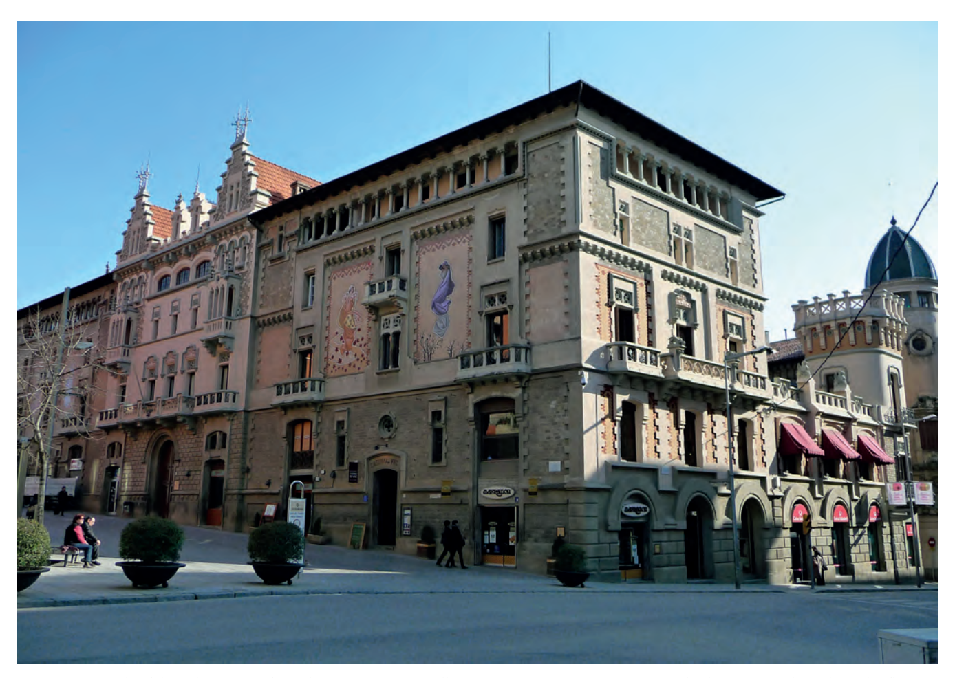
FIGURE 1. Façade of the Athenaeum of Vic, formerly Casa Comella. It is an Art Nouveau construction built in 1896 with mediaeval influence. In 1899, the Athenaeum moved its headquarters to the Art Nouveau-style Casa Comella located next to Plaça del Mercadal.

eneu de San Luis Gonzaga (Athenaeum of Saint Louis de Gonzague, 1866) of Sant Andreu.