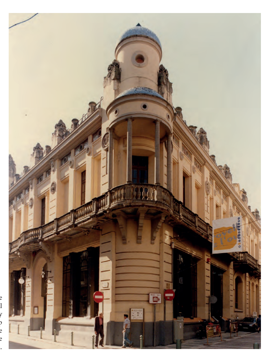
FIGURE 2. Building that houses the headquarters of the Casino Menestral Figuerenc (Tradesmen's Recreational Society of Figueres), designed by the architect Josep Bori i Gensana (1904). It is listed in the Inventory of Architectural Heritage of Catalonia.

Right at the turn of the decade, in 1860, the Cercle Literari of Vic was founded, a cultural association created with one chief goal: to link the individual initiatives of writers from Vic to the Renaixença movement. <sup>19</sup> Its participants included Jacint Verdaguer, Jaume Collell and Martí Genís i Aguilar. The entity's dynamism was extraordinary: it was behind the founding of several newspapers, assembled a library with more than 8,000 volumes, instituted literary prizes, and held several exhibitions, in addition to holding Catalan classes.