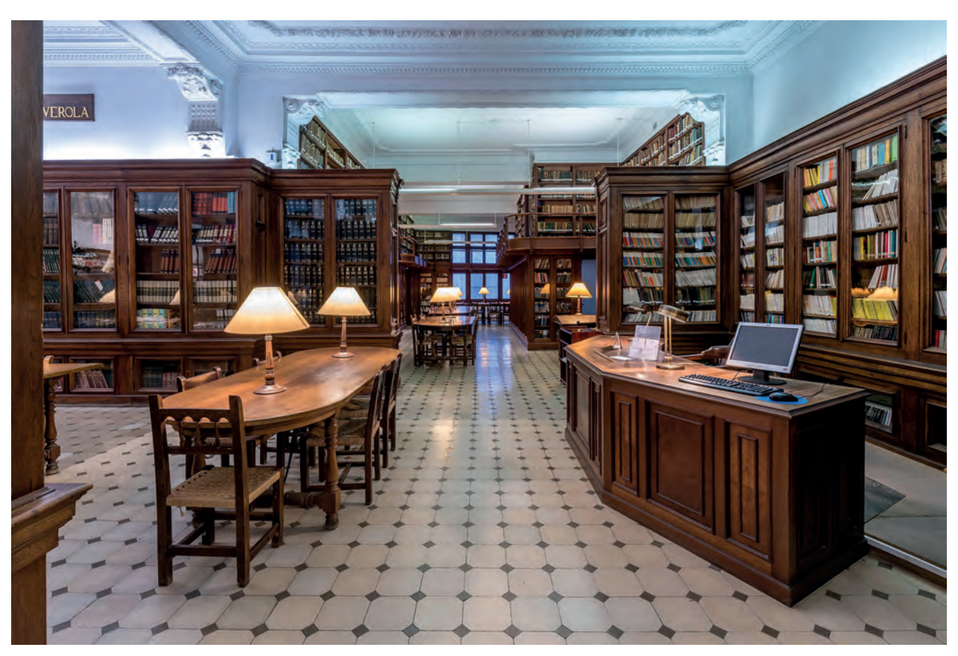
FIGURE 3. Library of the Centre de Lectura (Reading Centre) of Reus. This library, which was created in 1859, currently has a collection of approximately 200,000 volumes, including 20 incunables within its Reserve section, and books from the 16th, 17th and 18th centuries.

Only a few years after these three institutions were founded, another entity that also became emblematic was founded: in 1868 the Casino L'Aliança (L'Aliança Recreational Society) of Poblenou (which at that time was within the township of Sant Martí de Provençals) was founded, a recreational, cultural, social and mutualist entity.<sup>20</sup> Its original name was the Societat L'Aliança (L'Aliança Society), and this name remained until 1928, when it was reopened after it had been forcibly closed by Primo de Rivera's dictatorial regime, at which point it was reinstated with the name Casino L'Aliança del Poblenou.