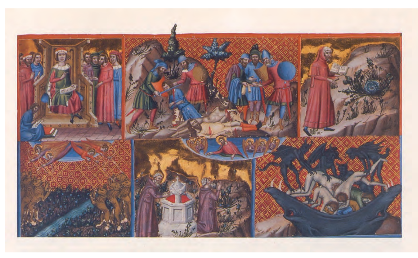
FIGURE 1. One of the images of the Saltiri-anglocatalà de París. It is a work by Ferrer Bassa, the Catalan representative of post-Giotto art with a northern influence as well.

the Coronation can be regarded as a crucial item in Ferrer Bassa's catalogue of works, just like his miniatures in the Saltiri anglocatalà de París , the Maimònides de Copenhaguen and part of the Llibre d'hores de Maria de Navarra , in addition to the severely damaged remains of an altarpiece of Saint Paul, plausibly identifiable as a commission from the Montcada family, a Man of Sorrows known by photographs and several other fragmentary expressions which remain today.