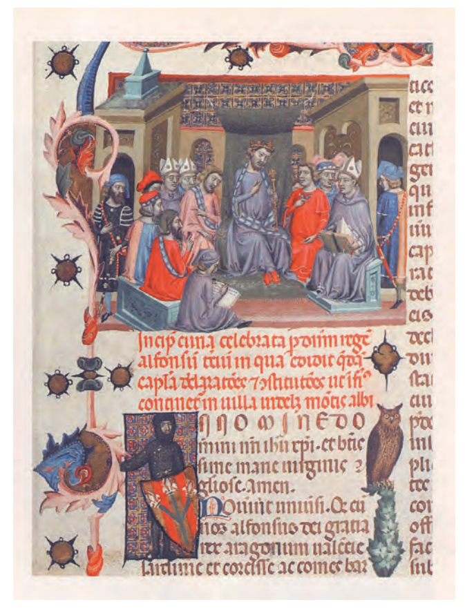
FIGURE 2. Miniature work by the Mestre de l'Escribà (Master of the Scribe), Usatges of the 'Paeria', or town hall, of Lleida. Alfonso the Magnanimous opened the Courts called in Montblanc in 1333.

Analysing Ferrer Bassa's training leads us to the main Tuscan and Adriatic schools. We should not lose sight of the fact that the resemblances with the Coronation of Bellpuig led works by Urbino or in the Mombaroccio sanctuary to be attributed to him.<sup>32</sup> In the painter's history, which is ridden with uncertainties, we cannot omit the fact that Giotto and his colleagues were active in Naples in around 1328-1332,<sup>33</sup> a city that might plausibly have been a stage in Ferrer Bassa's journey around Italy at a time near his return.<sup>34</sup> Alternatively, it is fairly clear that his younger collaborators also necessitate an analysis of eve-